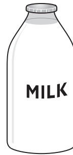
Traditional glass bottle