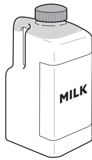
Modern plastic container