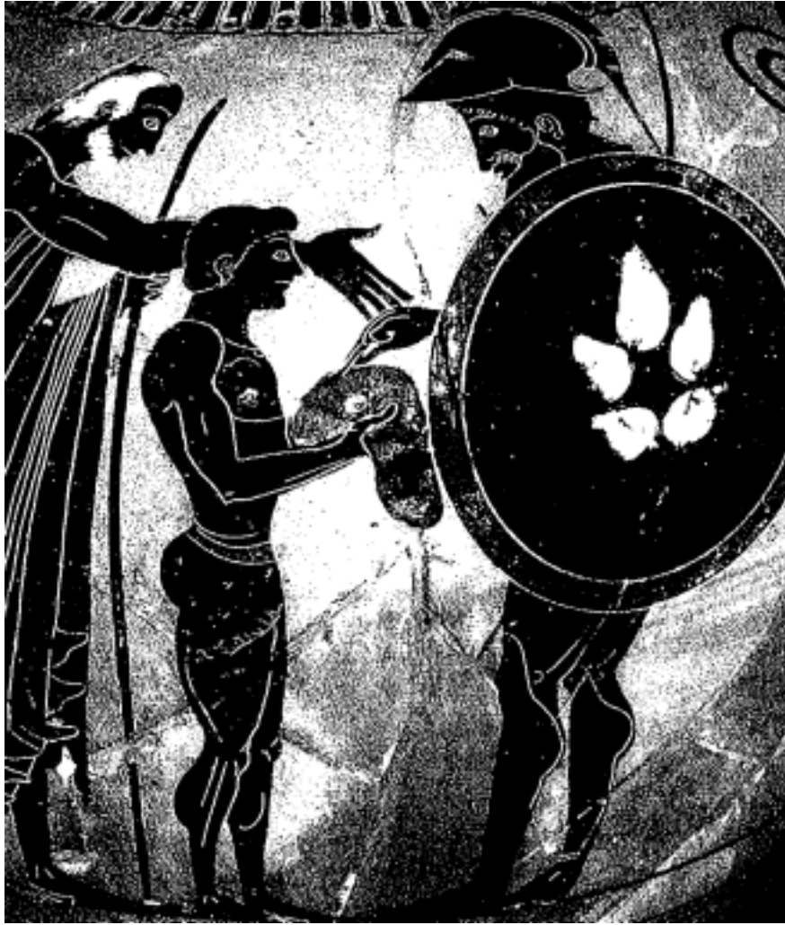
Religion (Young boy presenting a liver to a hoplite)