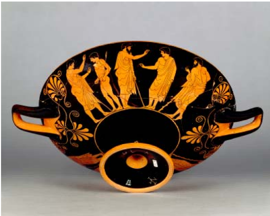
Athletics (Two figures on left hand side—Man crowned victor after success in the games)