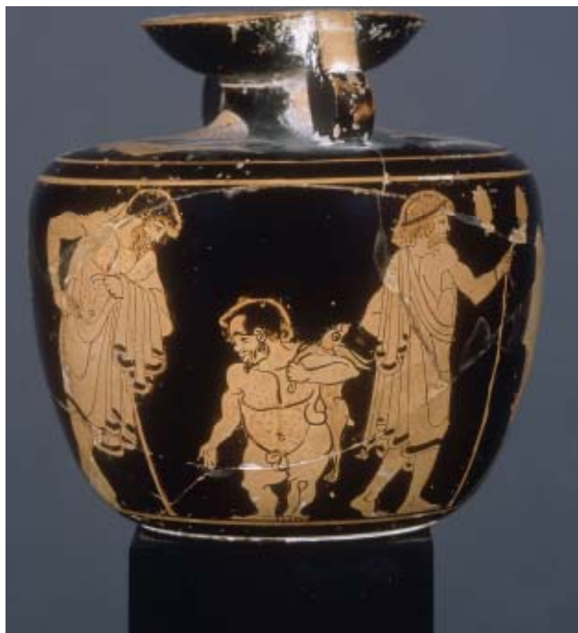
Occupations—doctors (A doctor treats a patient while others wait)