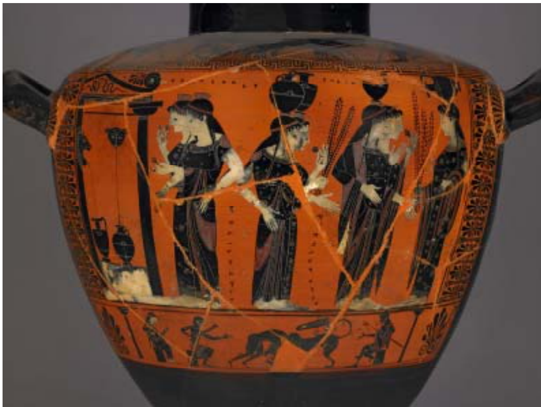
Worked carried out by women (Athenian woman fetching water from a public fountain)