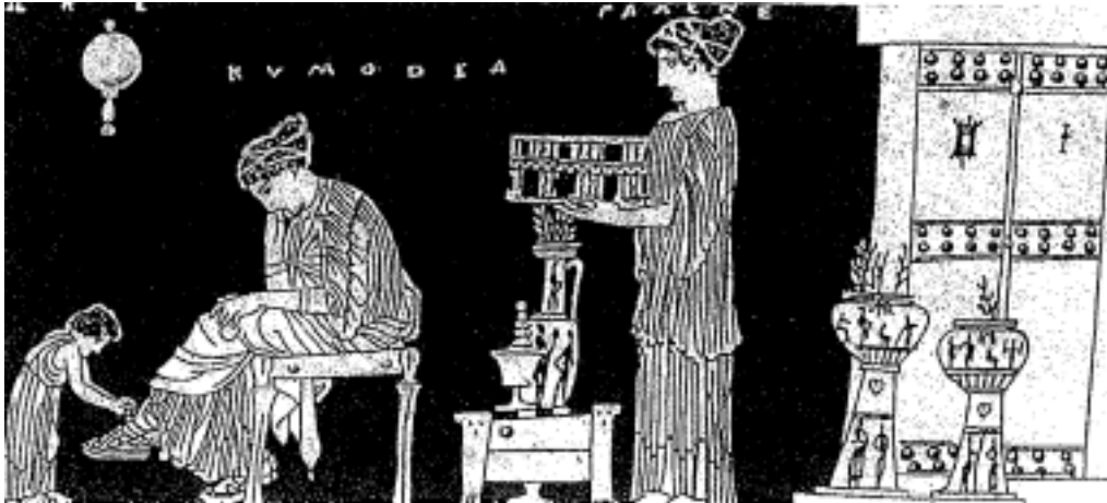
Women (a bride dressing for her wedding)