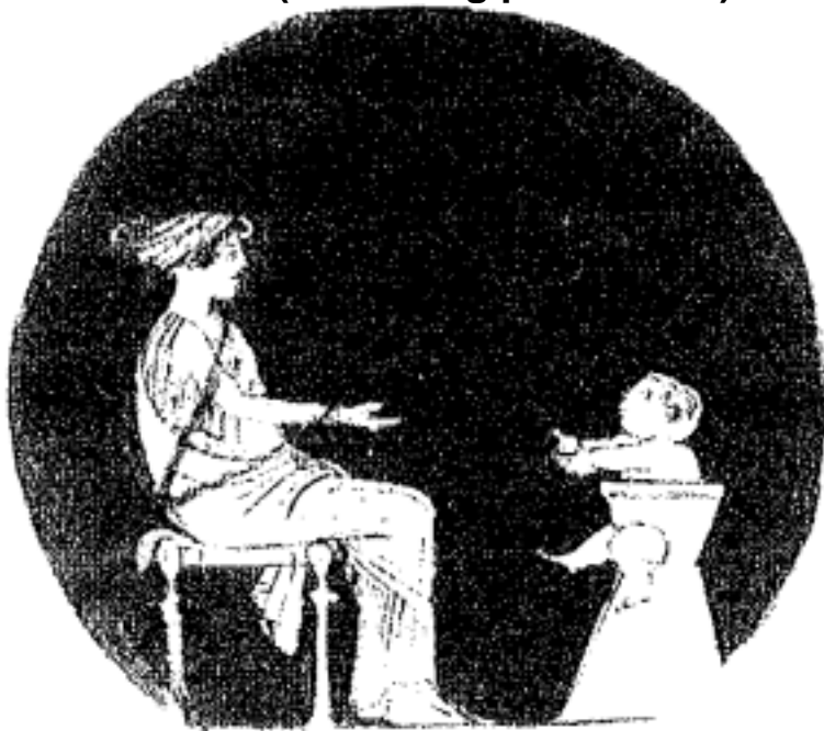
Women (A mother encourages her baby)