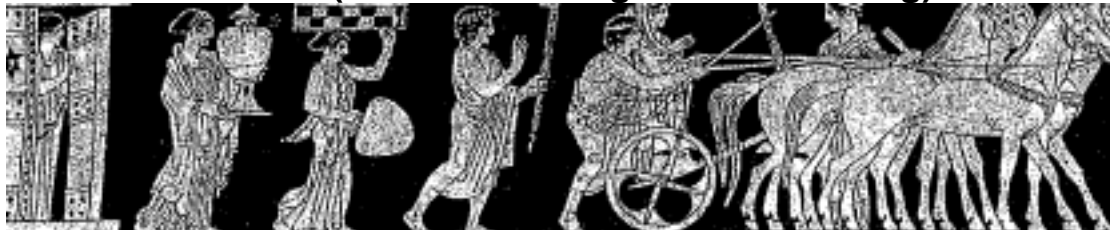
Women (a wedding procession)