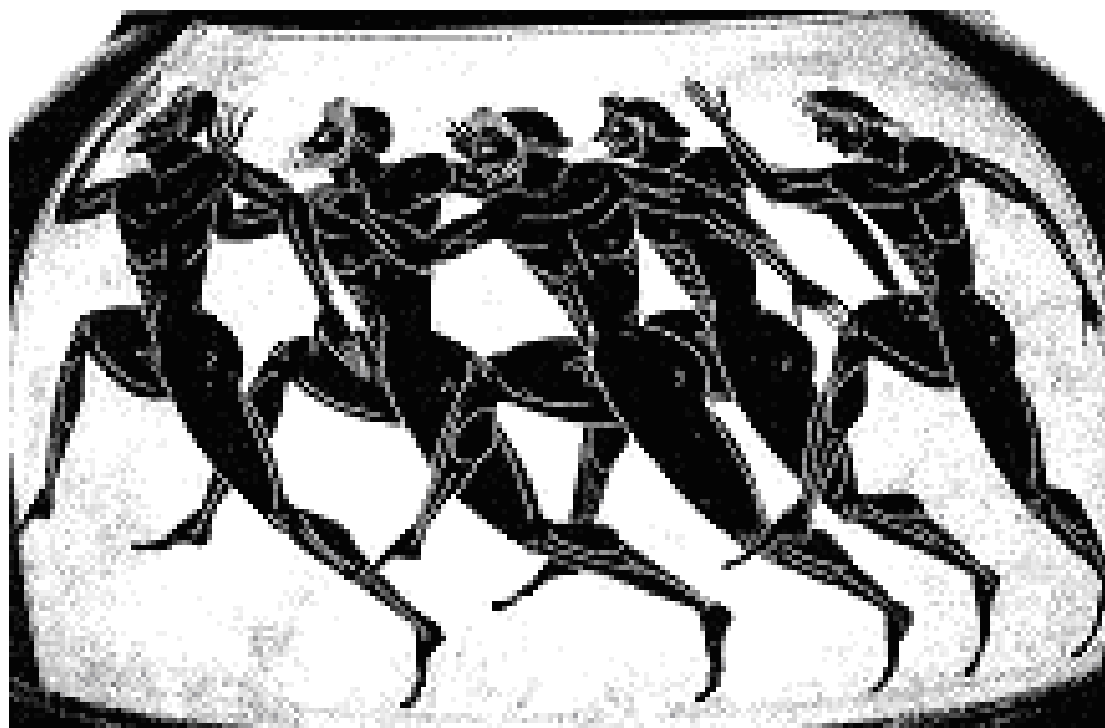
Athletics (five sprinters)