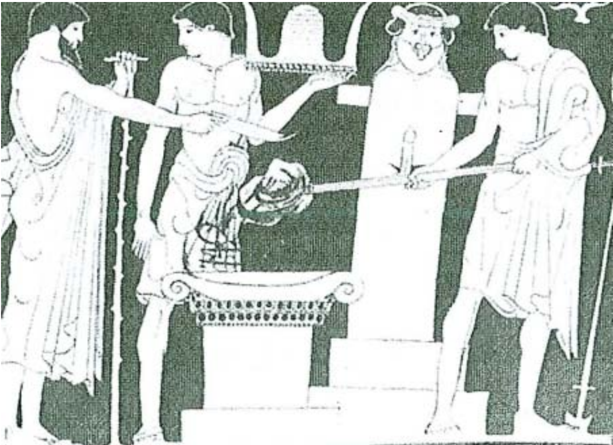
Religion ( A young man cooks the sacrificial meat on a spit before a Herm, whilst a man pours wine over the flames)