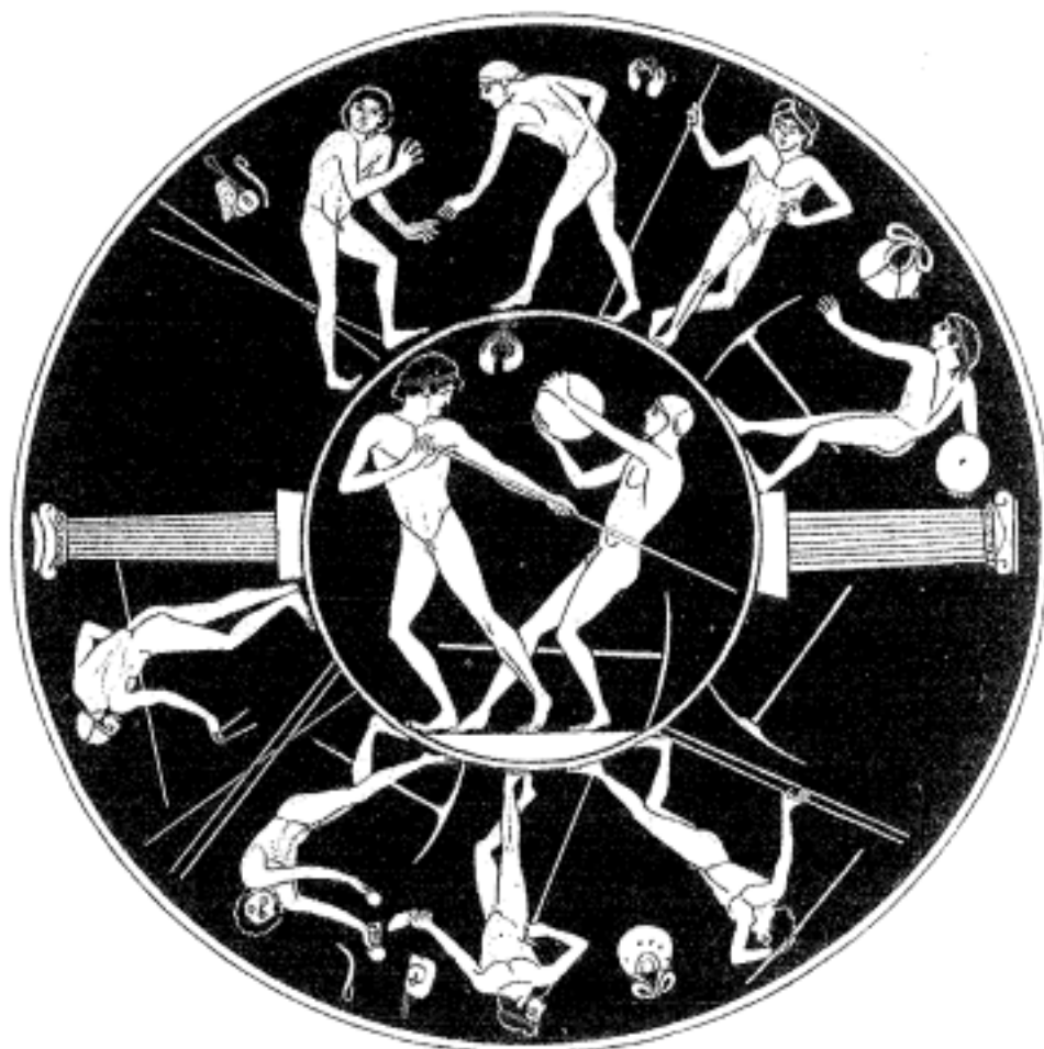
Athletics (Four events from the pentathlon: discus, long jump, javelin and wrestling)