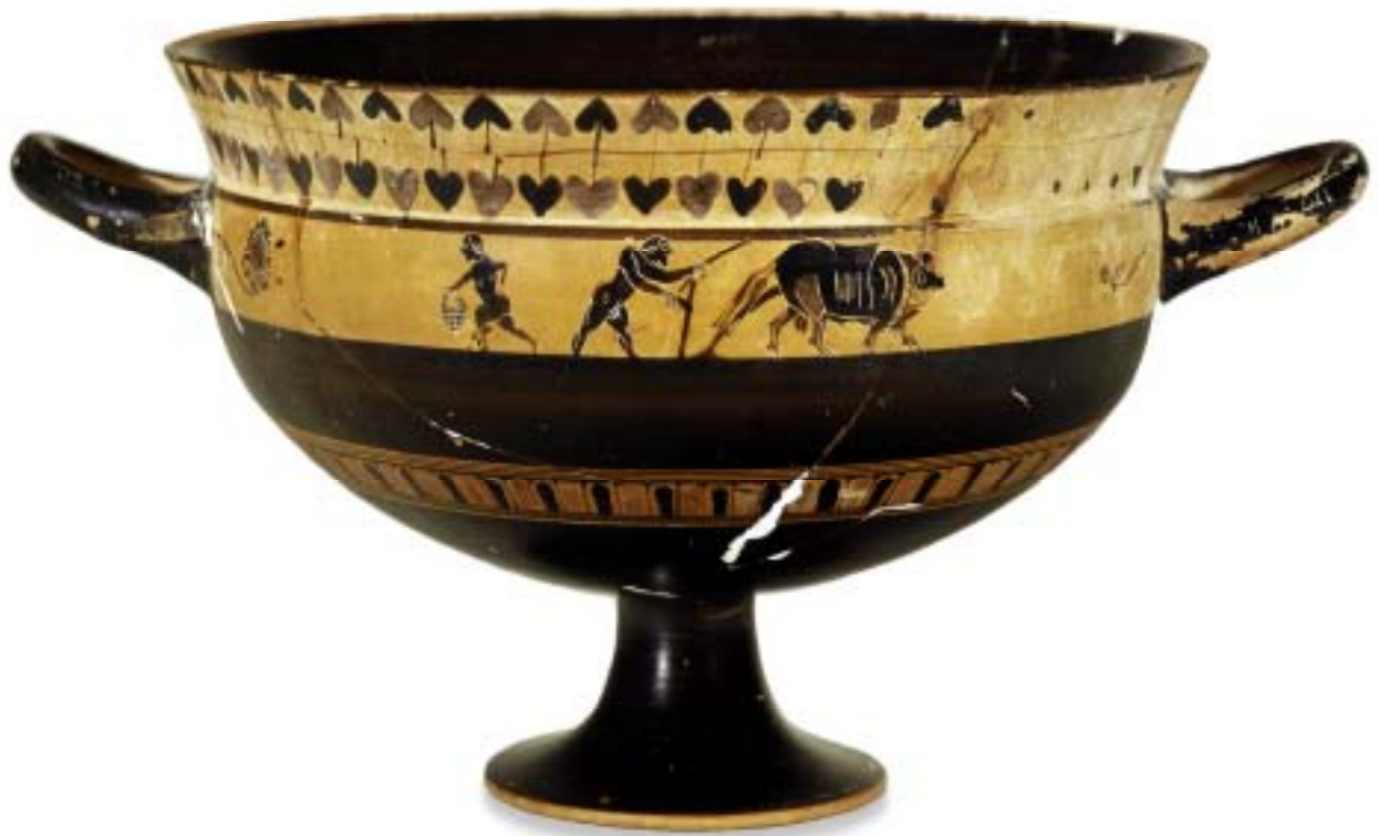
Occupations—farming (Ploughing and sowing)