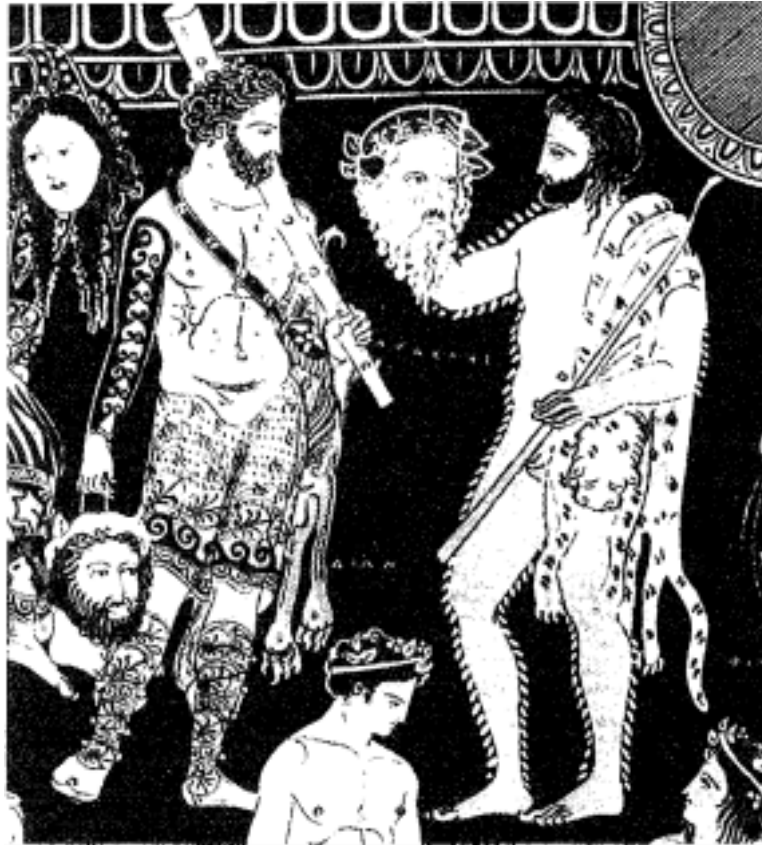
The Theatre (tragic actors in costume)