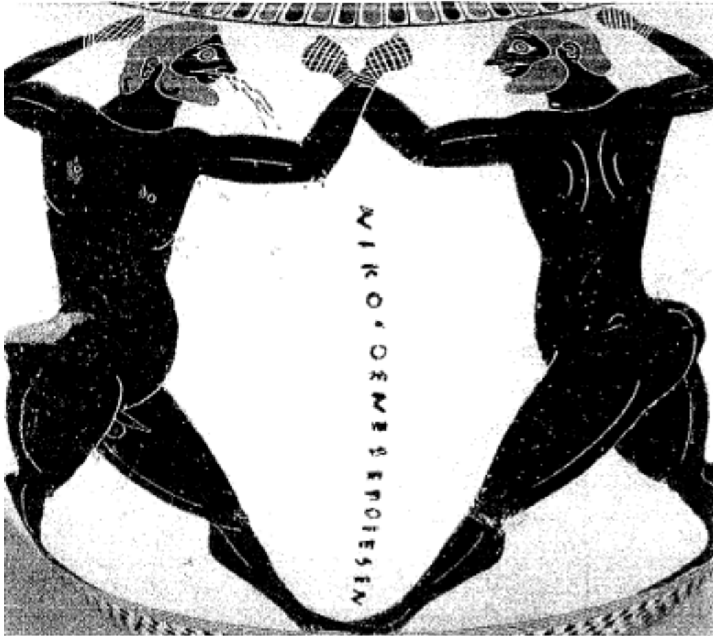
Athletics (Two boxers)