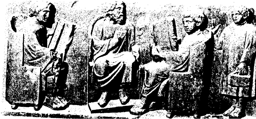
These Were The Romans

Study this photograph and answer the questions below.