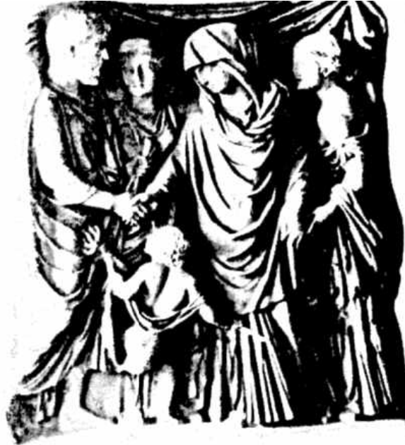
These Were The Romans , by permission of Gerald Duckworth & Co. Ltd

Study this photograph and answer the questions below.