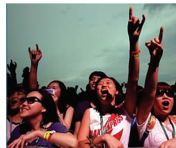
Young South Koreans enjoy themselves at a music festival

Photo: McKinsey http://www.mckinsey.com/insights/mgi/research/productivity_competitiveness_and_growth )