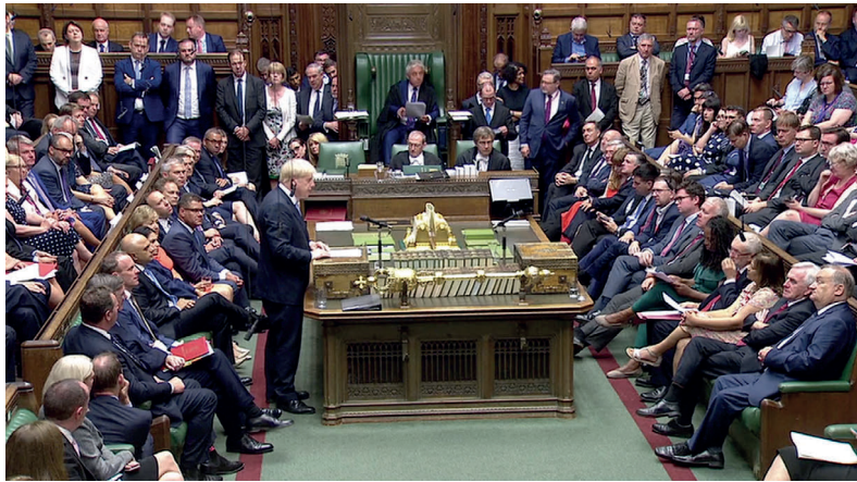
Source D is an image from the House of Commons. Members of Parliament (MPs) sit on specific benches in the House of Commons according to their roles.

Referring to Source D , discuss the significance of where MPs sit in the House of Commons.