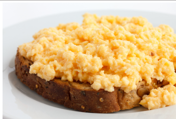
Scrambled egg on wholemeal toast

4 (a) Discuss the nutritional content of this breakfast for a four year old child. [6 marks]