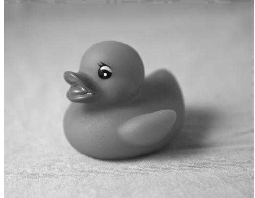
Phthalates are banned from babies' toys in Europe and the USA.

Plasticizers are added to polymers such as PVC to alter their properties. They make the PVC softer and more flexible. Several research studies have looked at the safety of one group of plasticizers called phthalates. As a result, the use of phthalates in toys for babies and young children is banned in Europe and the USA, but they are still used in products such as furniture and packaging.