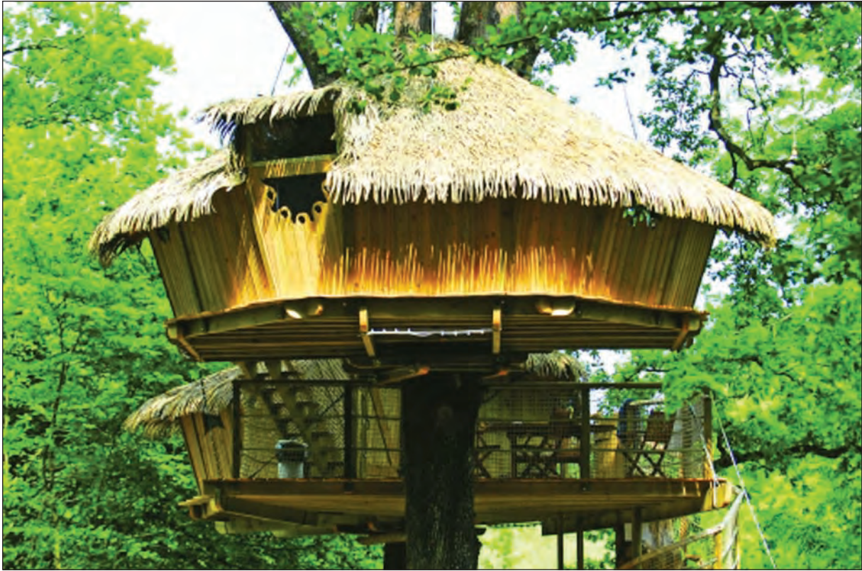
Treehouse in France