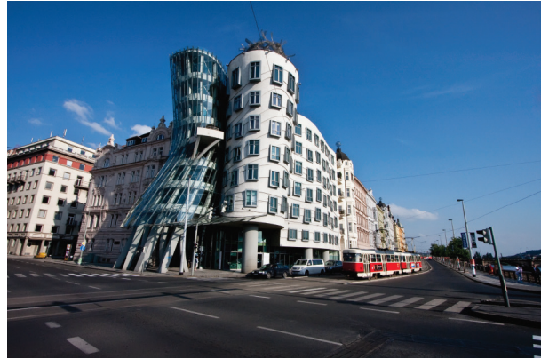
Frank Gehry Dancing House architecture

The effects of light can make a familiar environment become strange and mysterious.