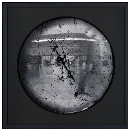
Steven Pippin Laundromat-Locomotion (Walking in Suit) photograph

A restricted view creates a sense of curiosity. In this photograph, Steven Pippin has used a washing machine as a camera to capture this unusual view.