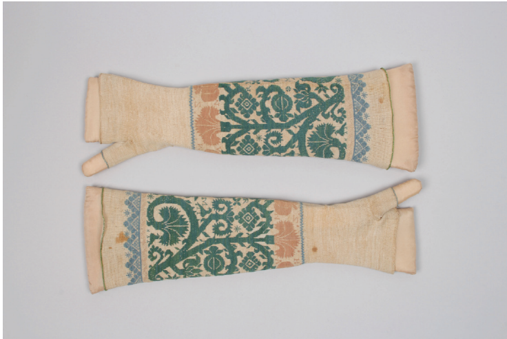
Pair of knitted elbow-length mittens, 1675–1725 (knitted silk/cotton mix, silk thread) textile

Overgrown foliage can inspire our curiosity. Plant forms have been knitted into a continuous pattern that travels around the arm of a glove. The layers of vegetation have been painted by Lucy Innes Williams using iridescent colours.