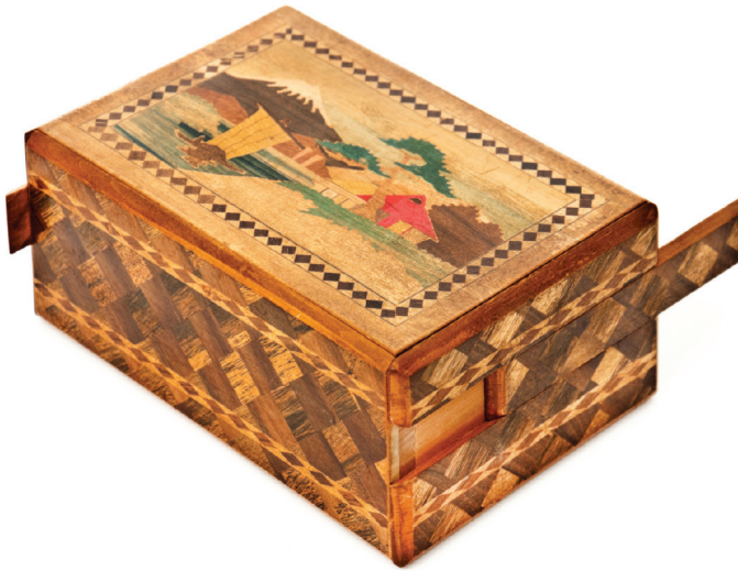
Japanese wooden "mystery" puzzle box three-dimensional design

Artists, designers and craft workers are often inspired to create work that conceals other things. The wooden box has nine tiny drawers, which may create a sense of curiosity. Keys, codes and passwords could be an inspiration for your ideas.