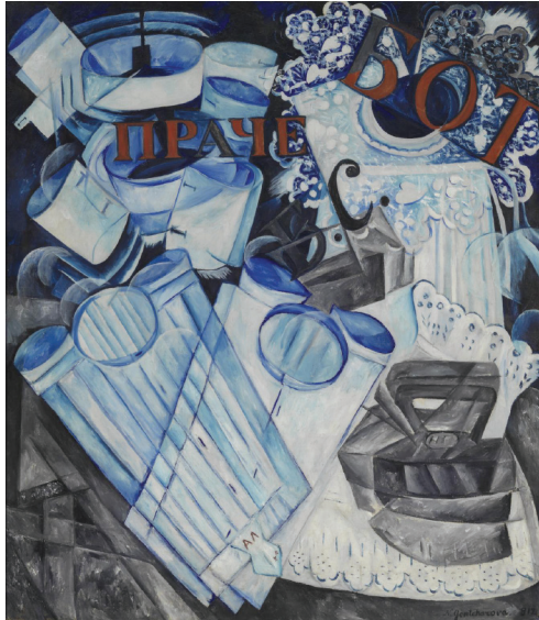
Natalia Goncharova Linen painting

Artists, designers and craft workers are often motivated to create works of art that change how we see something. The painting by Natalia Goncharova explores objects from many different viewpoints.