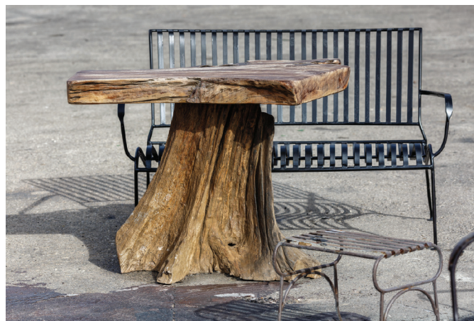
Furniture made of wood and metal handmade for the garden sculpture

The effect of wind and waves on wood creates smooth misshapen forms. The flowing lines on pieces of driftwood have been used to create the structure of a garden table.