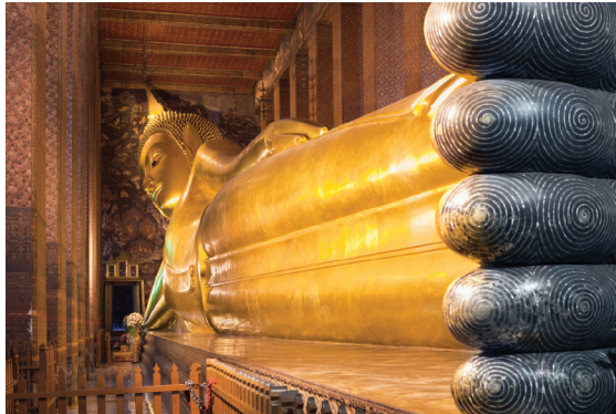
Reclining Buddha, Wat Pho, Bangkok, Thailand photograph

How the human body works has been a source of curiosity for artists, designers and craft workers. Clues to a person's identity can be found in their fingerprints or DNA. The reclining Buddha figure has curiously been given fingerprints on the toes. Faculties of the brain are explored in the symbolic head print.