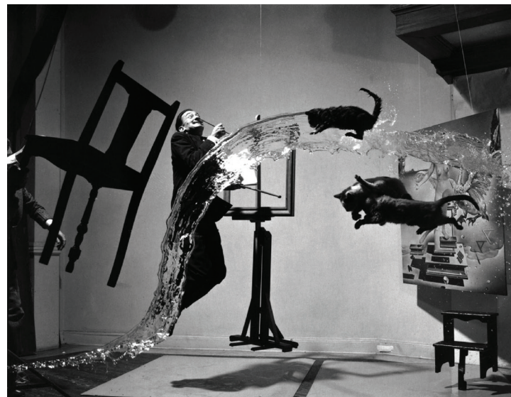
Philippe Halsman Dalí Atomicus photograph

This photograph by Philippe Halsman has been carefully staged to create an unusual and unlikely scene. The contact sheet reveals the secret of its production.