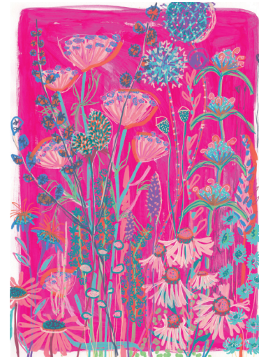
Lucy Innes Williams Pink Garden House, 2019 painting

The effect of wind and waves on wood creates smooth misshapen forms. The flowing lines on pieces of driftwood have been used to create the structure of a garden table.