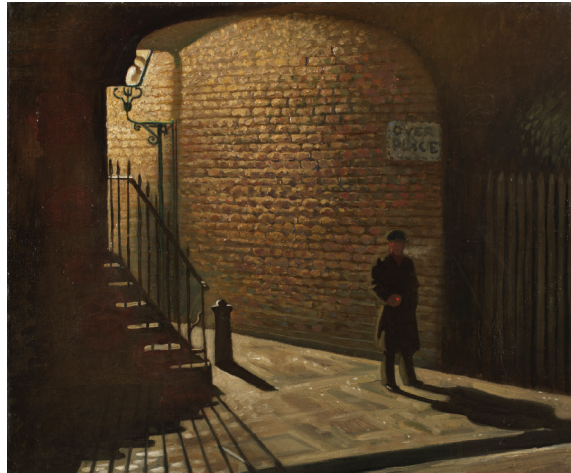
Douglas Percy Bliss A Lambeth Alley painting

Douglas Percy Bliss has used a strong contrast in light and dark to illustrate a lone figure in a dimly lit street.