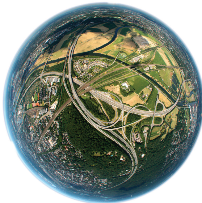
Hans Blossey Aerial view of spaghetti junction photograph

Aerial viewpoints could make us curious about the different routes we can take to get to the same destination. In the photograph, Hans Blossey shows the patterns created by intersecting roads and paths.