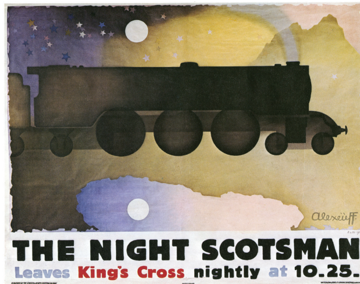
Poster advertising travel aboard the 'Night Scotsman' graphic design

Trips to new places can be seen as an adventure. In this poster a sense of mystery is created by using soft layers of watercolour behind the dark train.