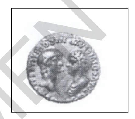
Coin showing Agrippina and Claudius