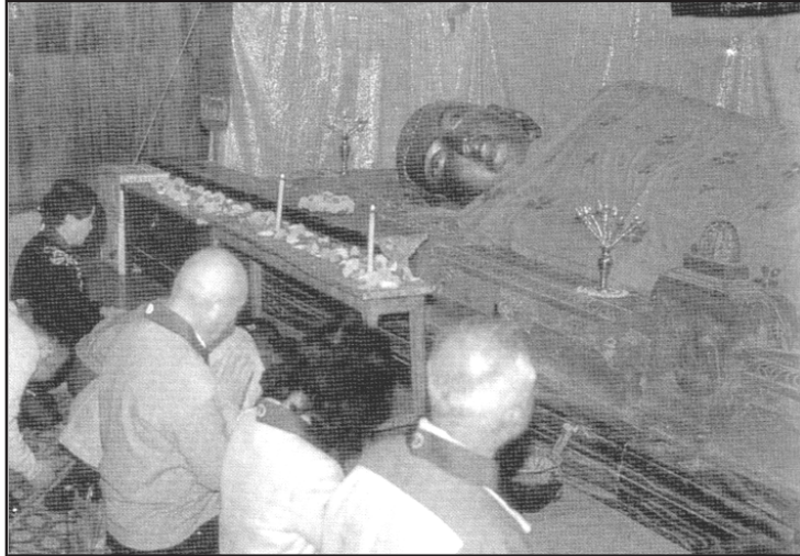
Inside a Buddhist temple