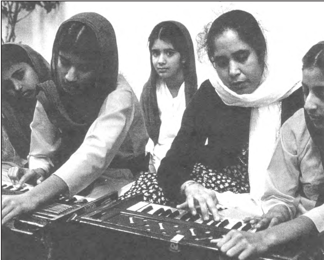
Women playing musical instruments in the gurdwara