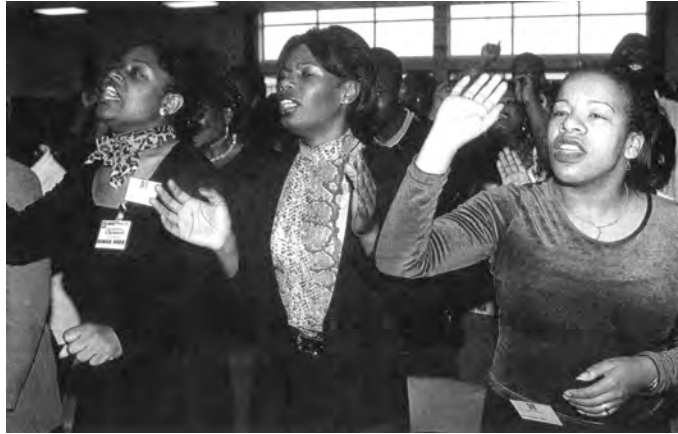
Christians worshipping God in church