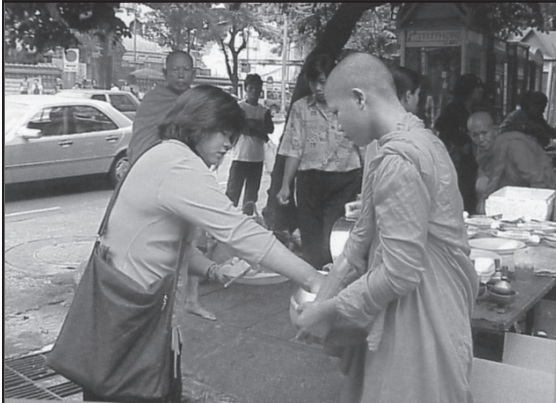
Buddhist monk receiving food from some faithful Buddhists in Bangkok