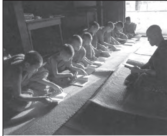
The Buddhist scriptures being studied in a monastery