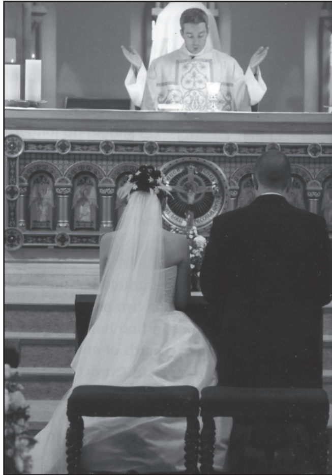
A wedding service