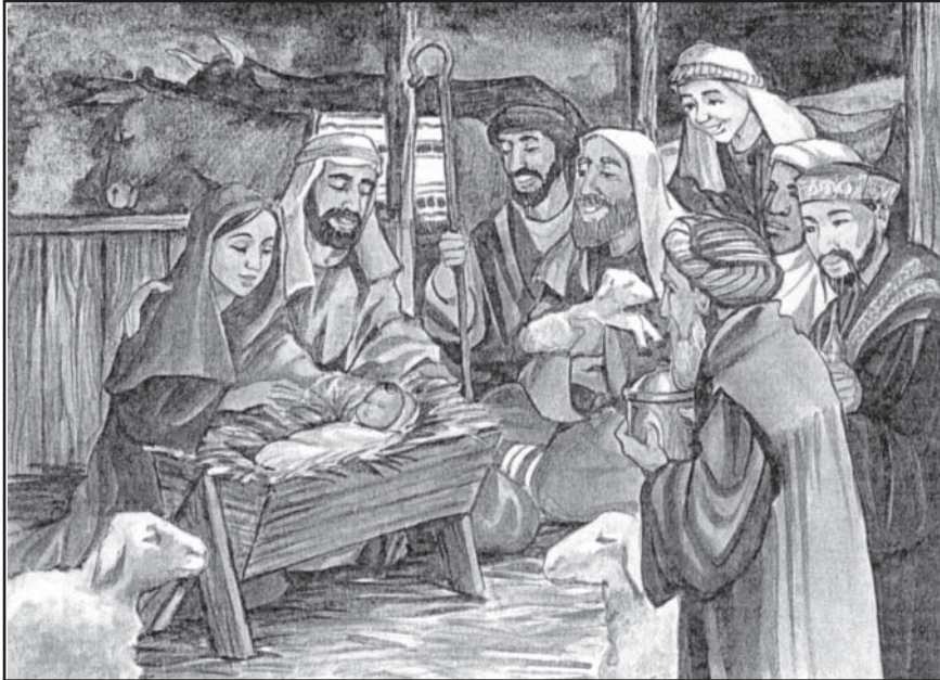
The birth of Jesus