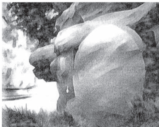
The garden tomb is closed with a heavy round stone