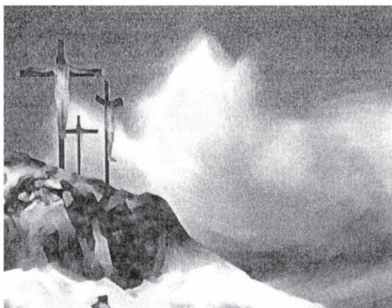
Jesus is crucified