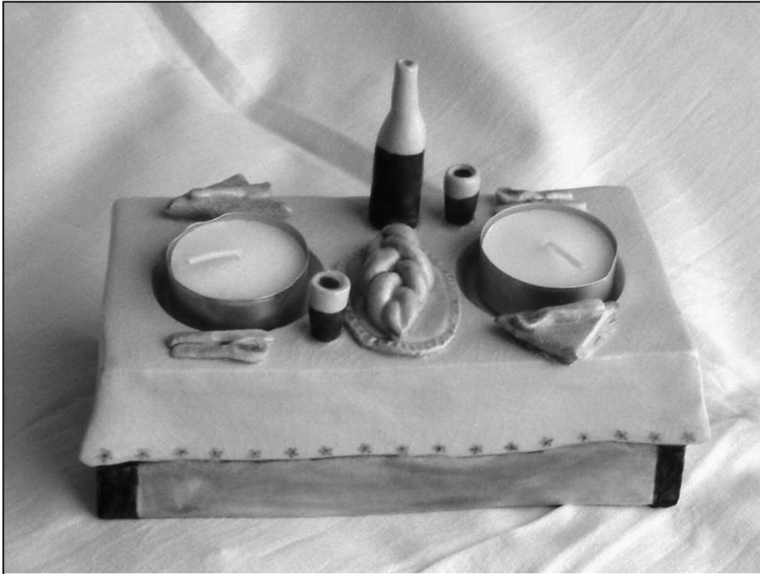
A Shabbat (Sabbath) table.