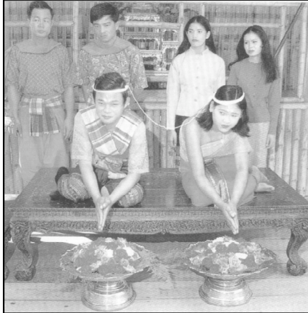
A Buddhist marriage at home. No monk is present and the ceremony has little religious importance.