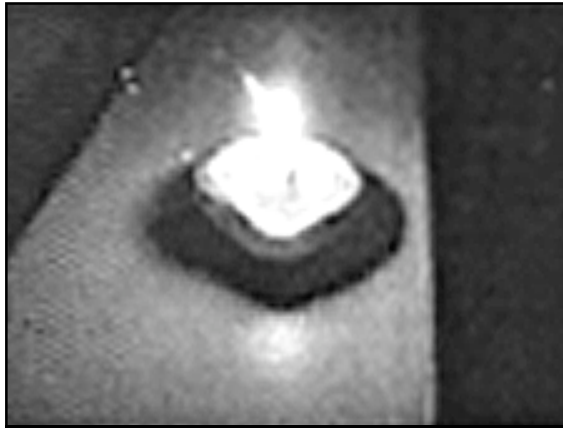
Picture of divali lamp