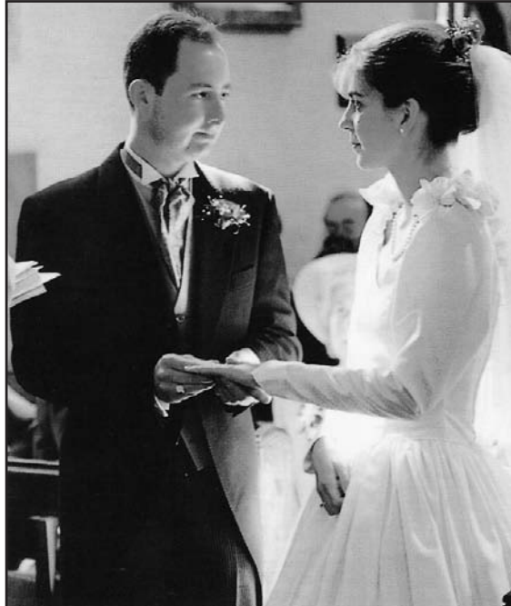
A bride and groom.