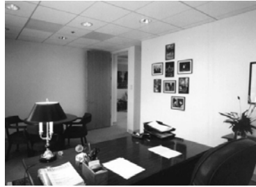
in an office