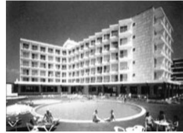
in a hotel