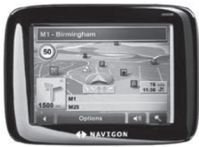
Route finding software

6 Look at these different sources of information which can be used to plan journeys.