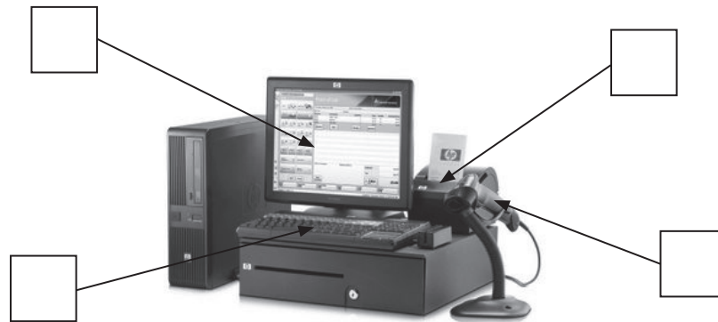
Figure 2 – EPOS Terminal