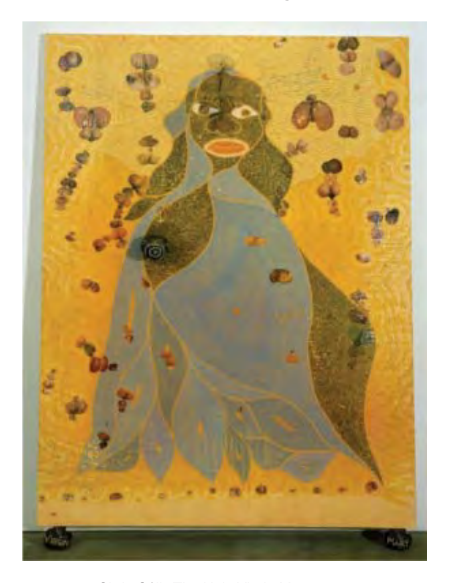
Chris Ofili, The Holy Virgin Mary, 1996

(paper collage, oil paint, glitter, polyester resin, map pins, elephant dung on linen) ( 243.8 \times 182.9 cm) (Mona, Tasmania/Saatchi Gallery)