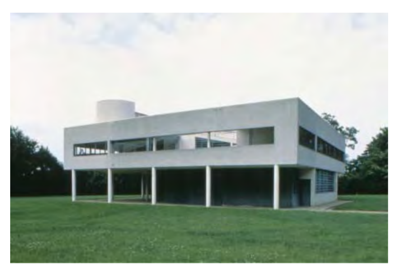
Le Corbusier, Villa Savoye, Poissy-sur-Seine, 1929