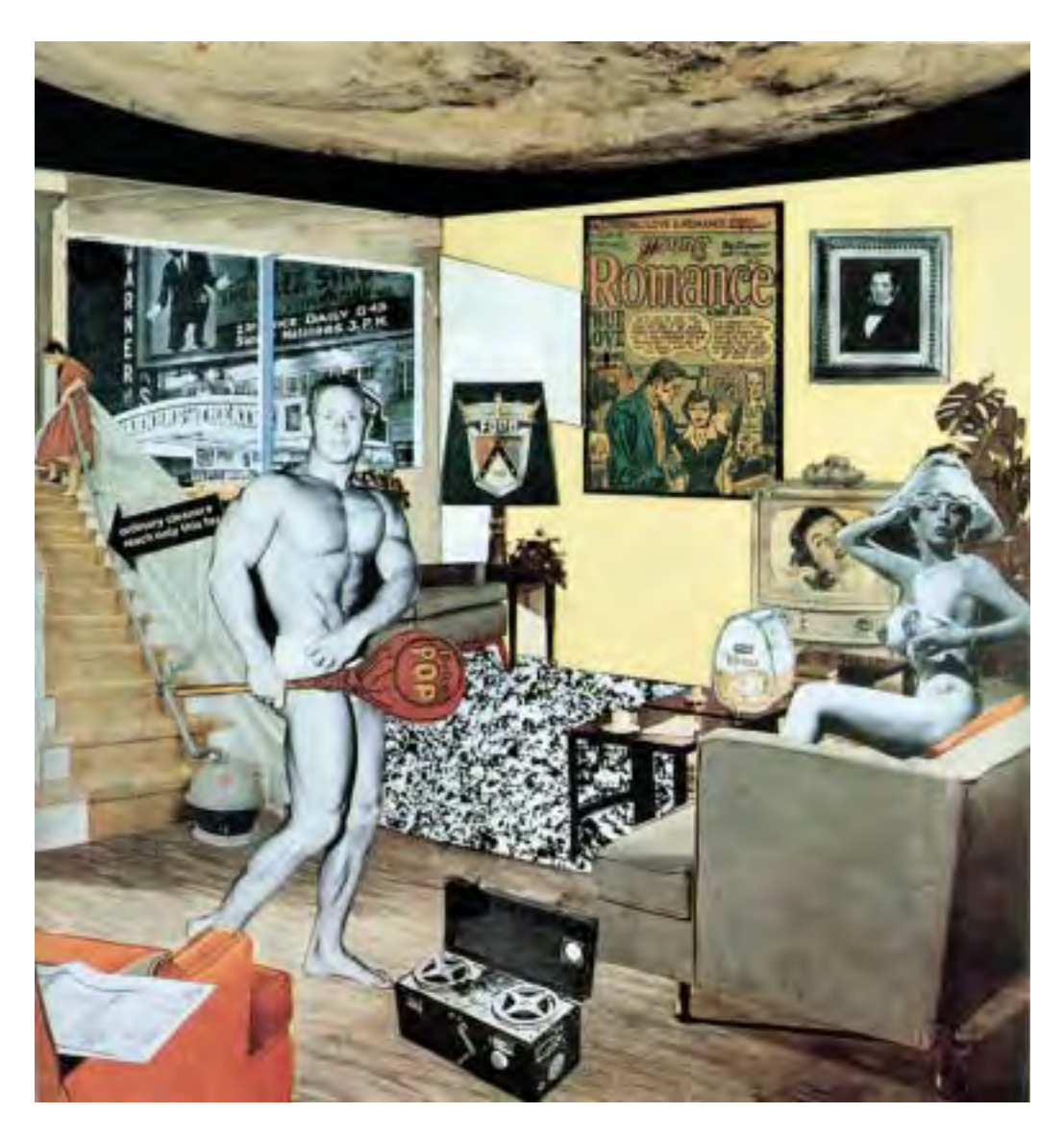
Section 4: Drawing, printing, photography, collage and film

Richard Hamilton, Just what is it that makes today's homes so different , so appealing? 1956