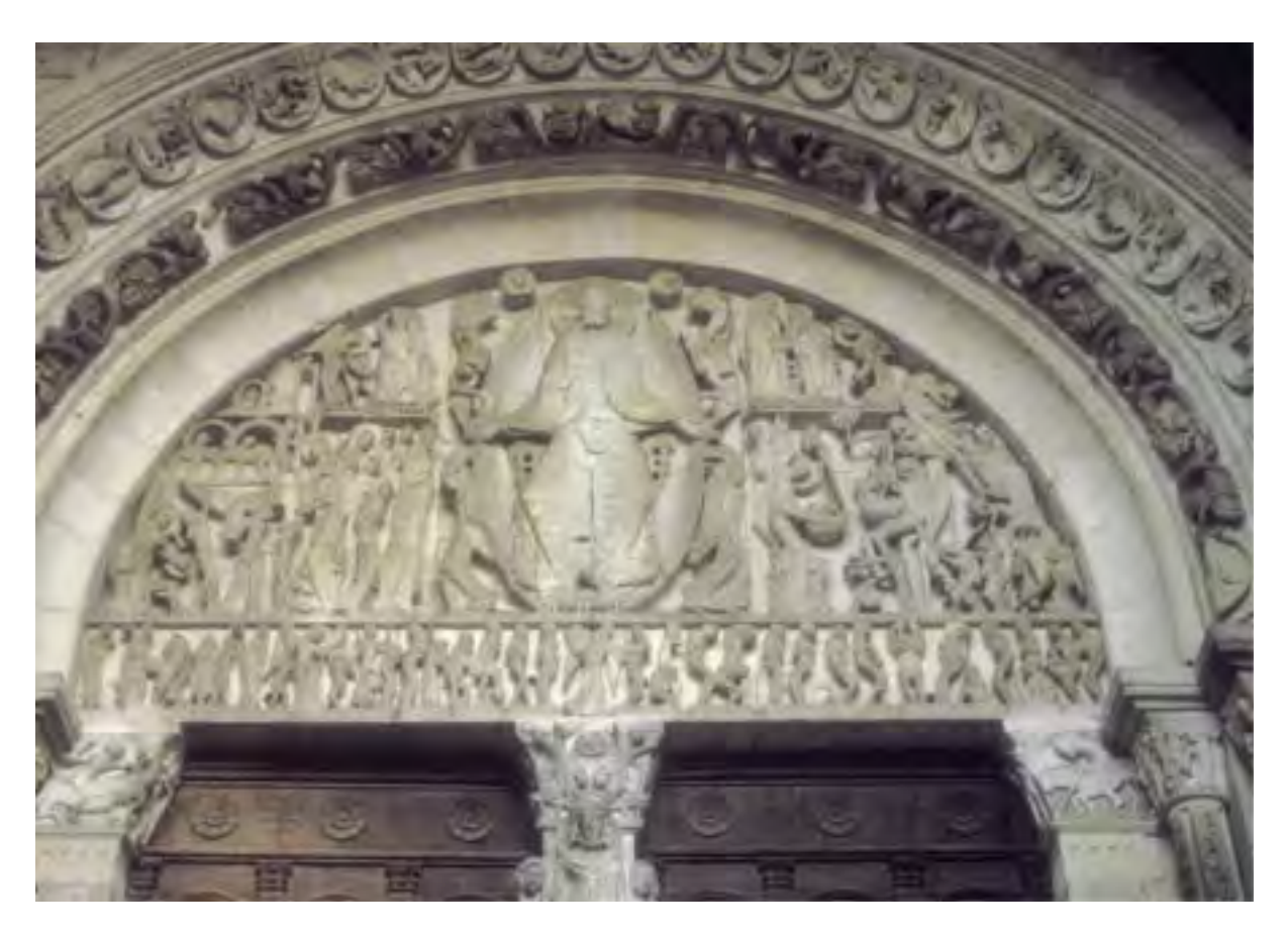
Gislebertus, Tympanum , Autun Cathedral, c.1130–45 (stone) (width 640 cm) (Cathedral of Saint-Lazare, Autun)

2 (a) What are the main stylistic features of this sculpture?