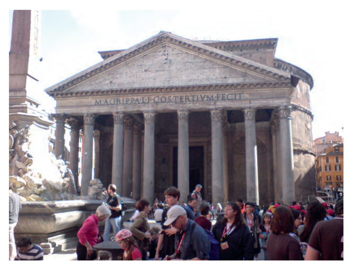
The Pantheon, c.130 AD, Rome