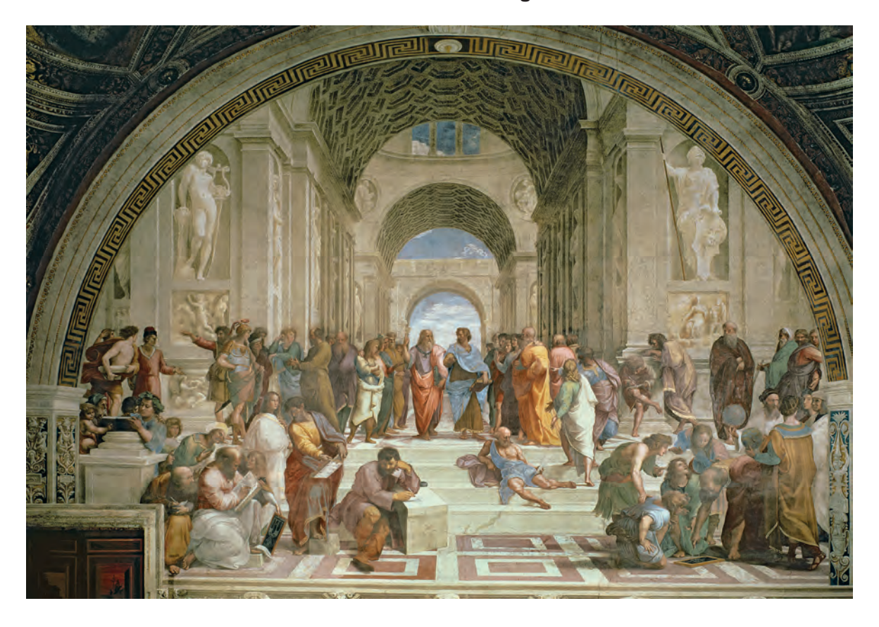
Raphael, The School of Athens , 1509–11 (fresco) ( 500 \times 770 \, \text{cm} ) (Stanza della Segnatura, Vatican, Rome)