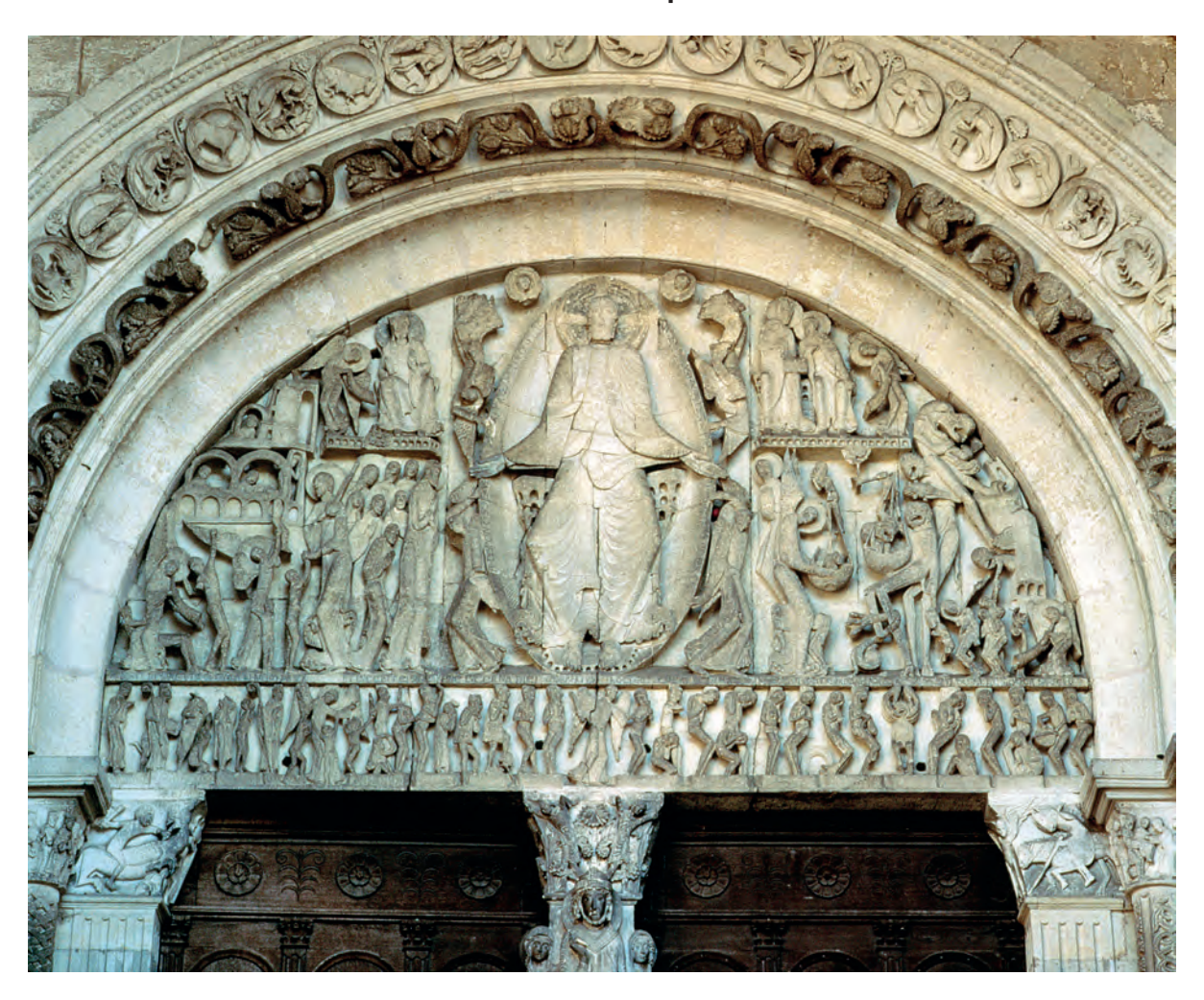
Gislebertus, Tympanum , 1130–45 (stone) (width 640 cm) (Cathedral of Saint-Lazare, Autun)

2 (a) What are the main stylistic features of this sculpture?