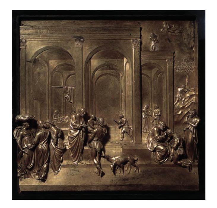
Section 2: Sculpture