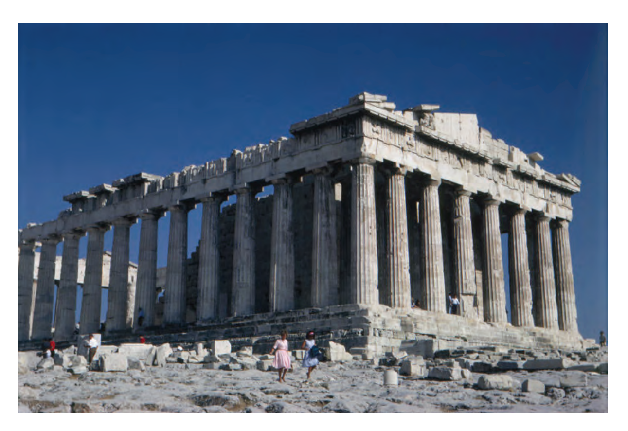
Iktinos, Parthenon, Athens c. 448-432 BC