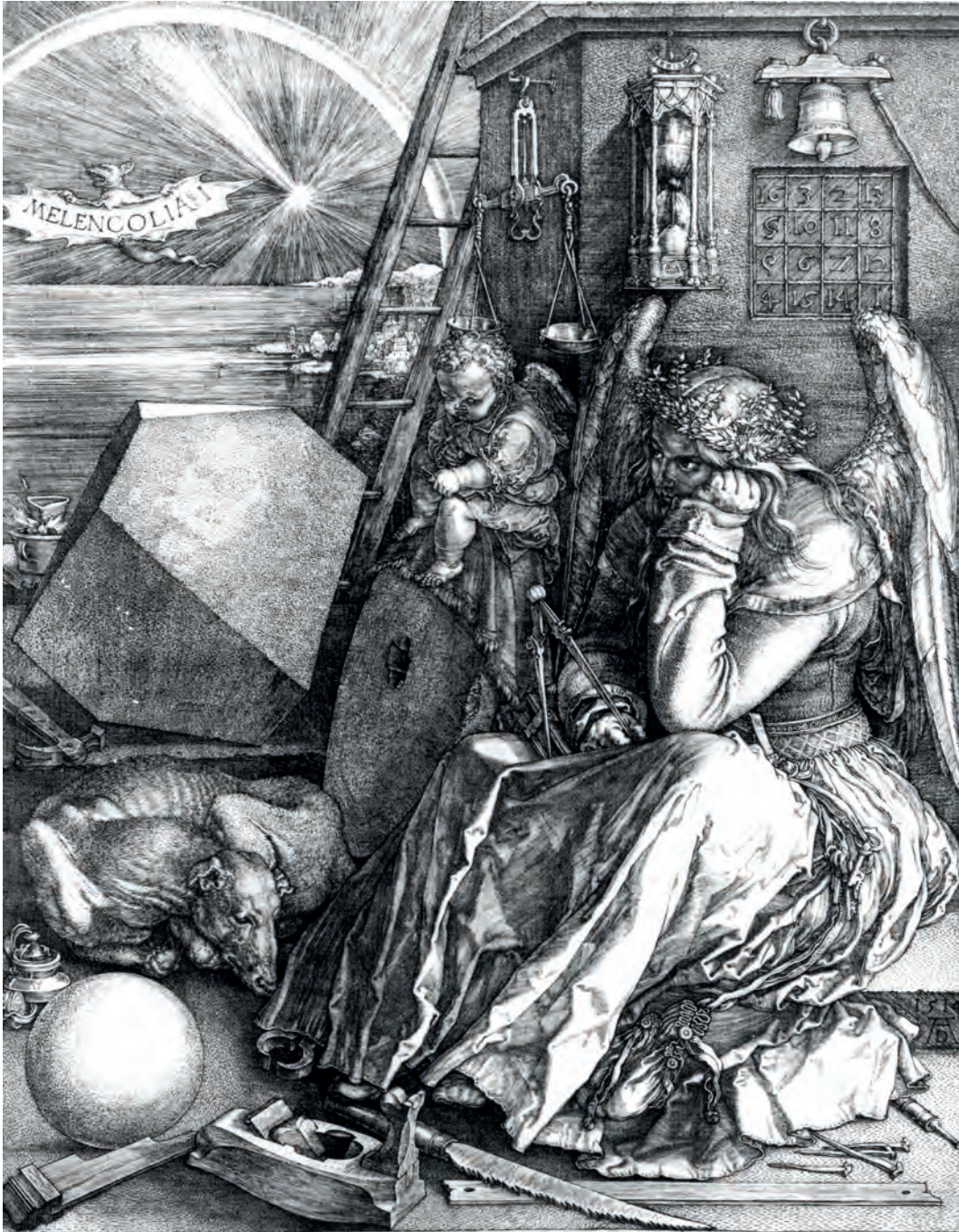
Albrecht Dürer, Melencolia I , 1514, (engraving), (23.8 × 18.5 cm)