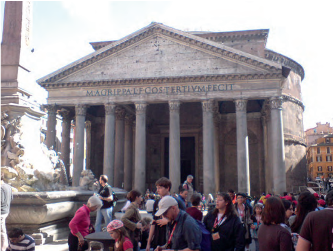
The Pantheon, c.130 AD, Rome