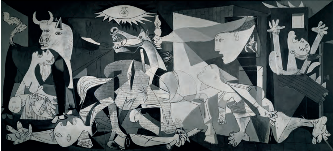
Pablo Picasso, Guernica , 1937, (Oil on canvas), (3.5 × 7.8 m), (Museo Reina Sofía, Madrid)