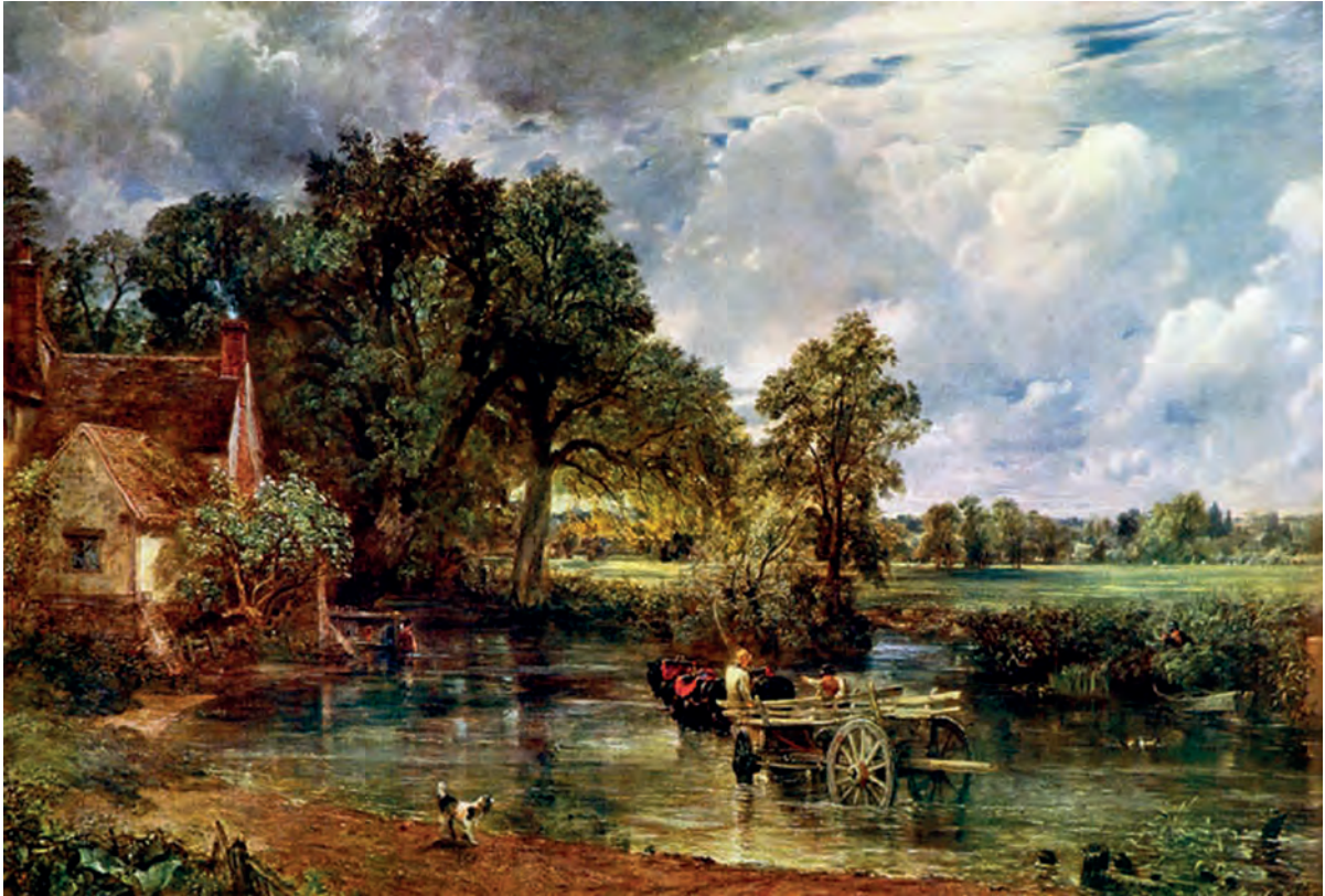
John Constable, The Hay Wain , 1821 (oil on canvas), (130 × 185 cm), (National Gallery, London)