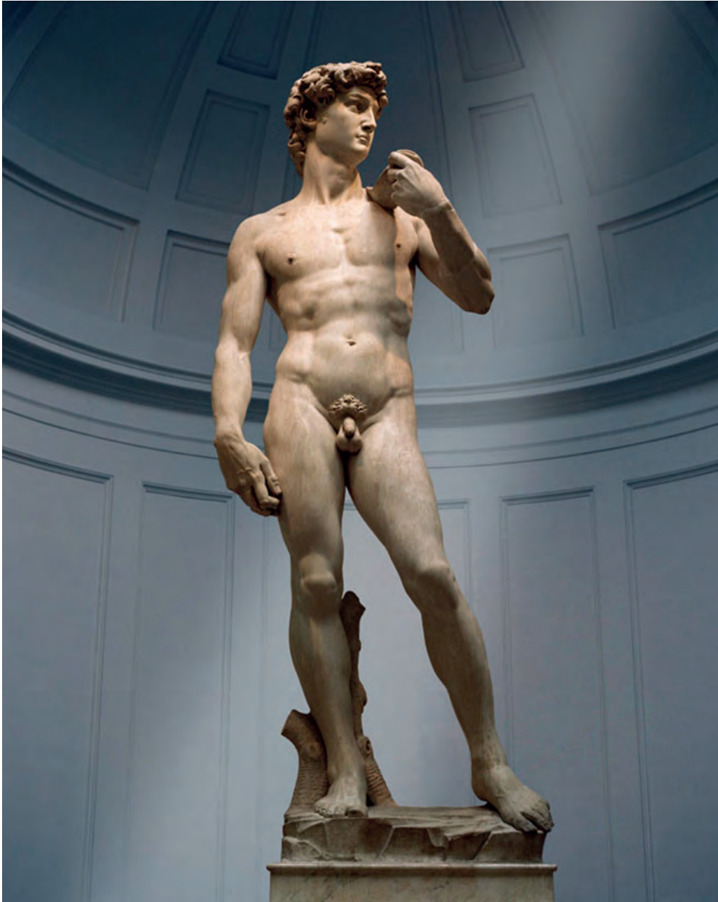
Michelangelo, David , 1501–4 (marble), (h. 4.34 m (incl. base)), (Florence, Galleria dell'Accademia)