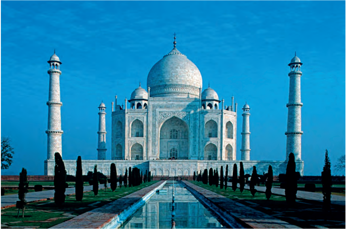
The Taj Mahal, 1632–48, Emperor Shah Jahan, Agra