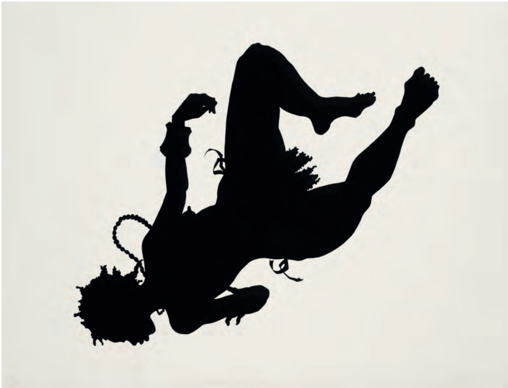
Kara Walker, African/American , 1998. (Linoleum cut, composition) (93 × 106.7 cm) Museum of Modern Art, New York