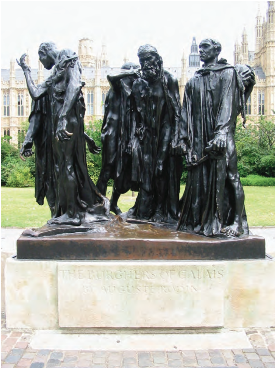
Auguste Rodin, The Burglers of Calais , 1884–6 (bronze)

(217 cm × 255 cm × 177 cm) (Victoria Tower Gardens, London)