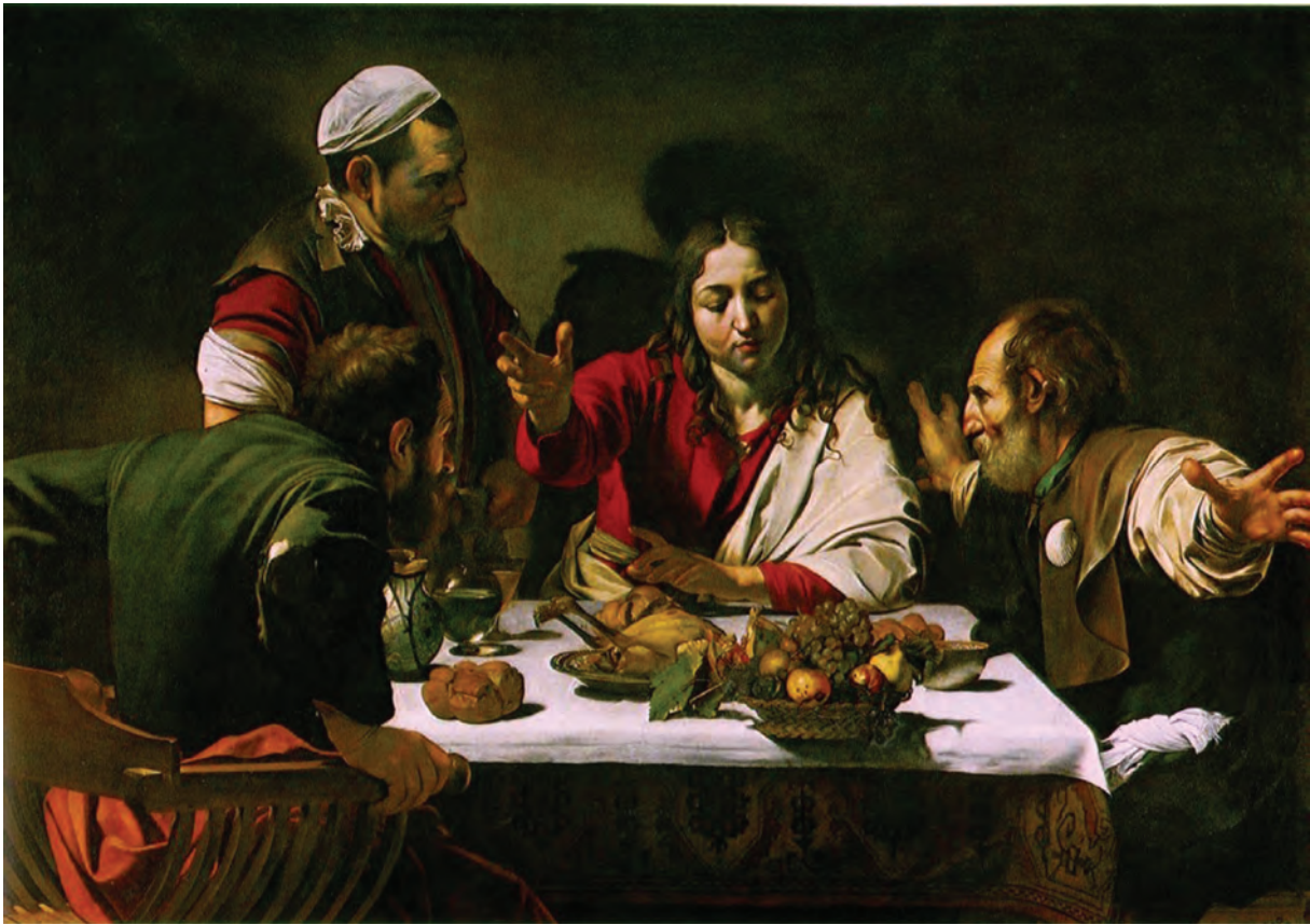
Caravaggio, The Supper at Emmaus , c.1601

(oil and egg tempera on canvas) (141 cm × 196.2 cm) (National Gallery, London)