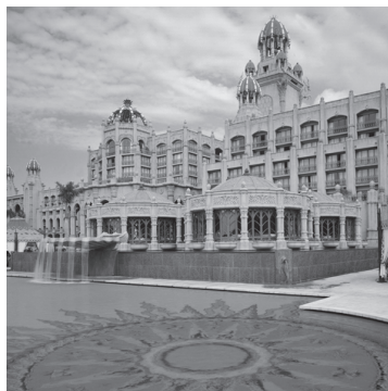
Palace of the Lost City

Sun City boasts four hotels, each of which offers a unique holiday experience, from romance to family fun.