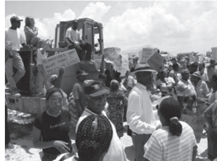
Protests to stop Bimini tourist resort

The multimillion dollar Bimini Bay Resort is threatening both local communities and their environment. The project, which once built will include a golf course, marinas and apartments, has outraged local community members who have staged a protest outside the development to stop the construction.