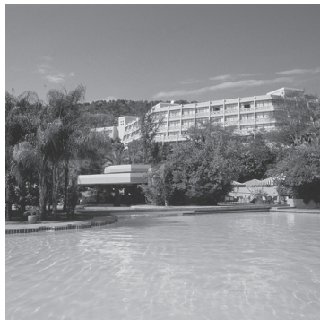
Sun City Hotel