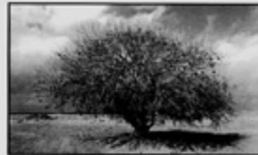
The ancient tree near as-Safawi (4G)