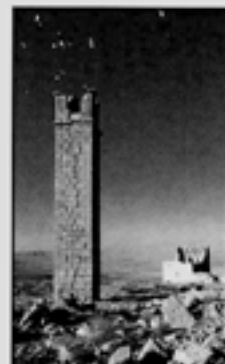
Umm ar-Rasas (Mayfa'a) (6E)