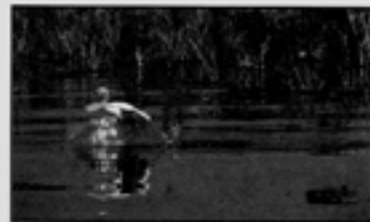
The River Jordan