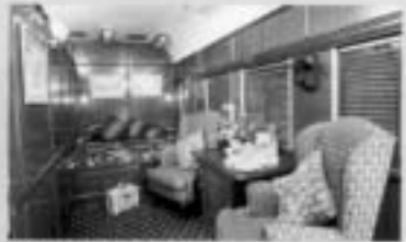
Rovos Rail Train

During the day the dress is smart casual. For the evening, jackets and ties are required for dinner.