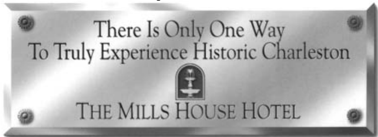
Fig. 2 for Question 1