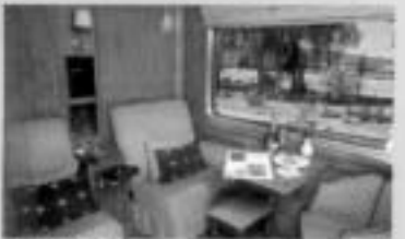
Blue Train cabin

During the day the dresscode is smart-casual. For dinner, a more formal attire is required - jackets and ties should be worn by gentlemen.