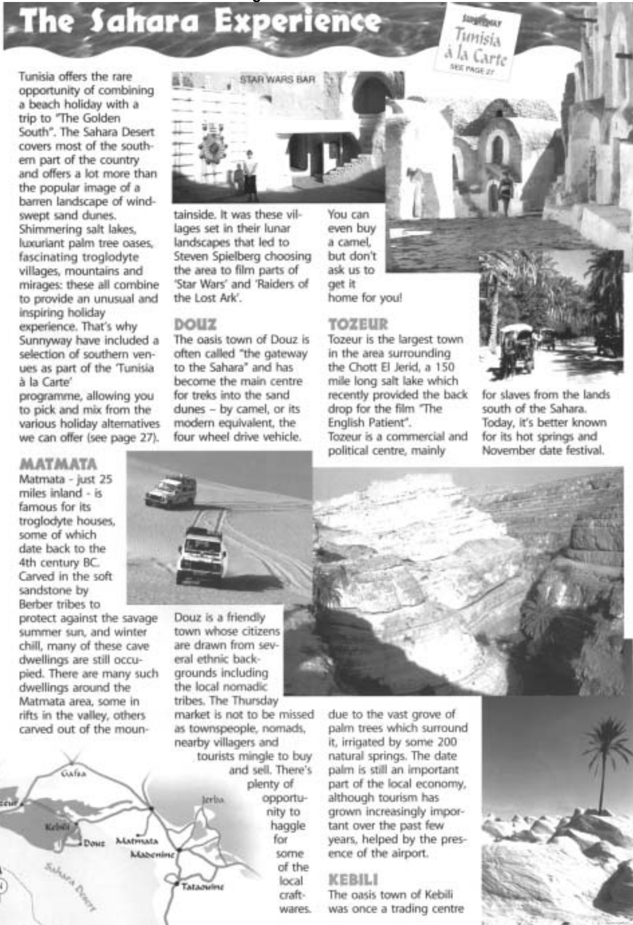
Fig. 5 for Question 3