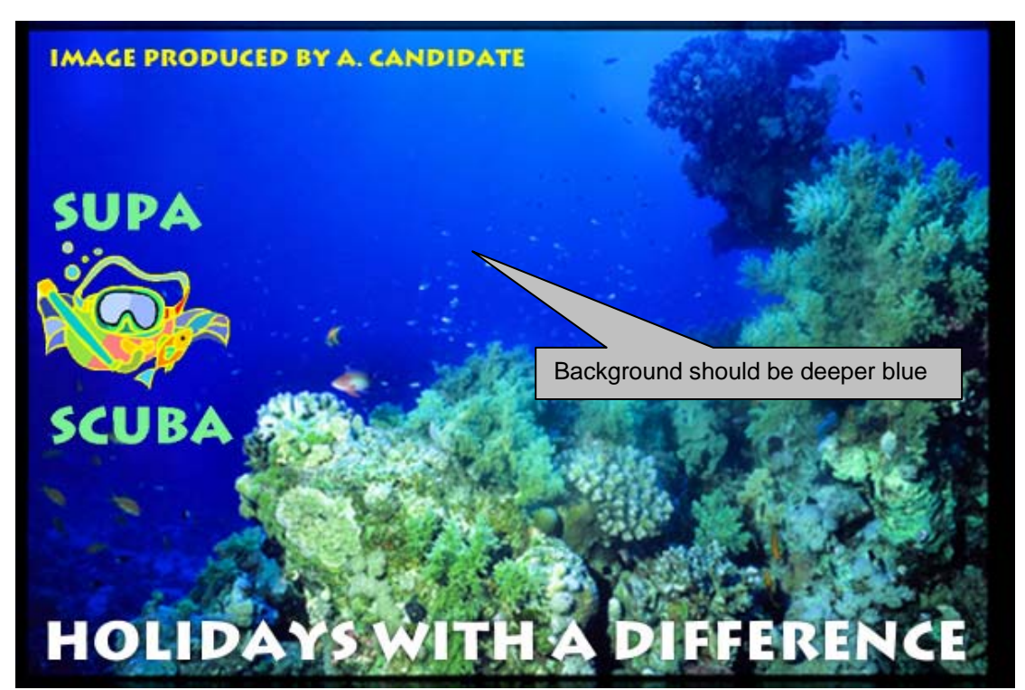
Printout at step 16