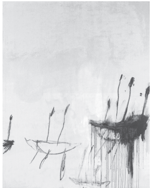
Plate 4: Cy Twombly, b. 1928, USA. Three studies from the Temeraire , 1998–1999. Three panels, oil on canvas, Left panel, 253.5 cm × 202.5 cm Centre panel, 261.3 cm × 202.5 cm Right panel, 260.3 cm × 195.5 cm Art Gallery of New South Wales. © Cy Twombly

Using the subjective frame, compare Cy Twombly's series of three paintings with Turner's work.