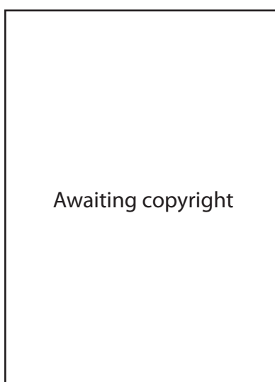
Plate 2: Photograph of Ron Mueck making final adjustments to his work Two Women , 2005.