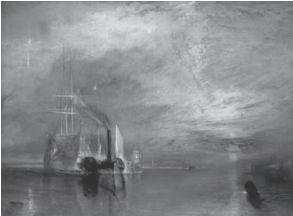
Plate 5: Joseph Mallard William Turner, 1775-1851, Britain.

The fighting Temeraire tugged to her last berth to be broken up 1838, 1839.