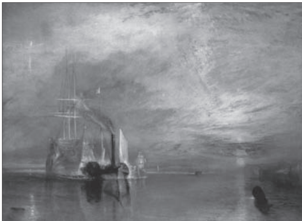
Plate 5: Joseph Mallard William Turner, 1775-1851, Britain. The fighting Temeraire tugged to her last berth to be broken up 1838, 1839. Oil on canvas, 90.7 cm × 121.6 cm, National Gallery, London.