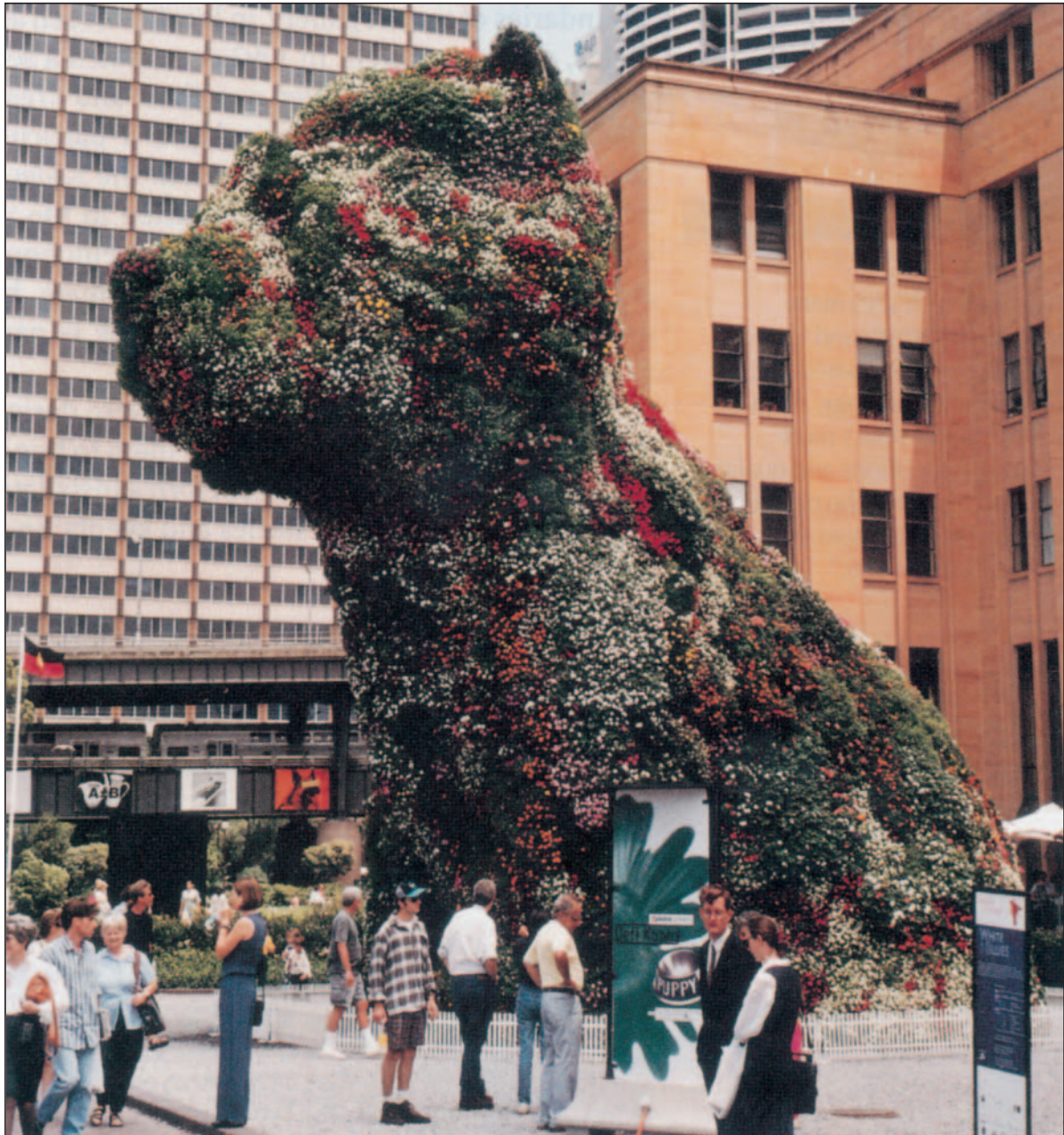
Plate 3: Photograph of audience viewing Jeff Koon's installation, Puppy , 1996, steel, live flowers and soil, 12 \times 2.5 \times 6.6 m, in front of the Museum of Contemporary Art, Circular Quay, Sydney.