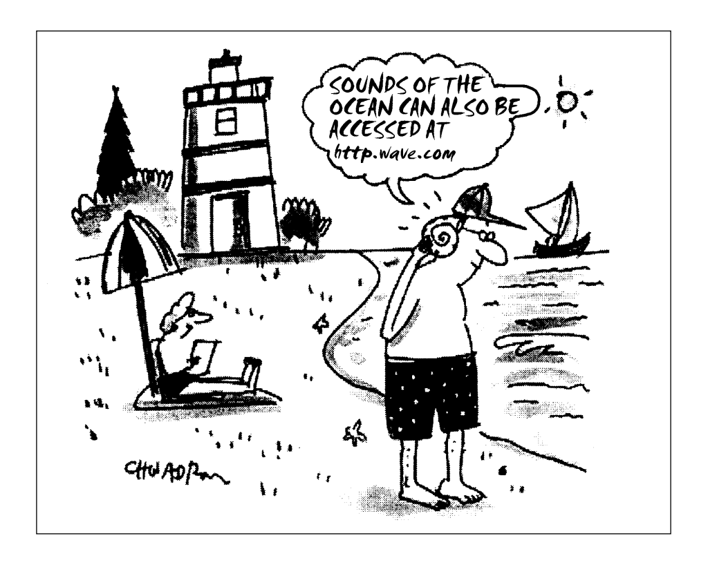
End of Question 2