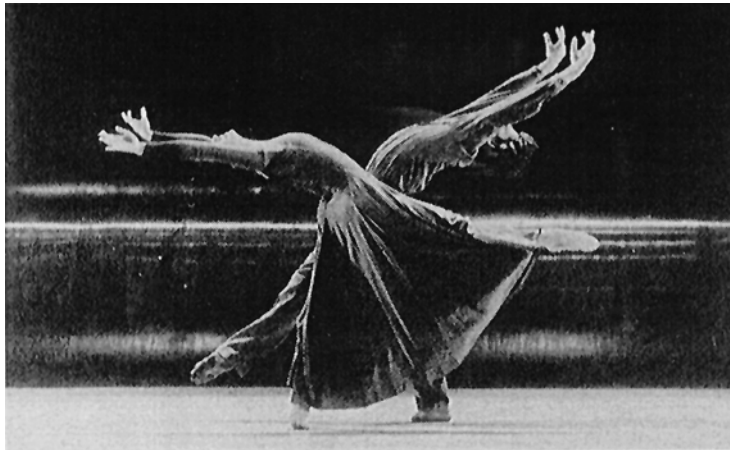
NEDERLANDS DANS THEATRE, FORGOTTEN LAND