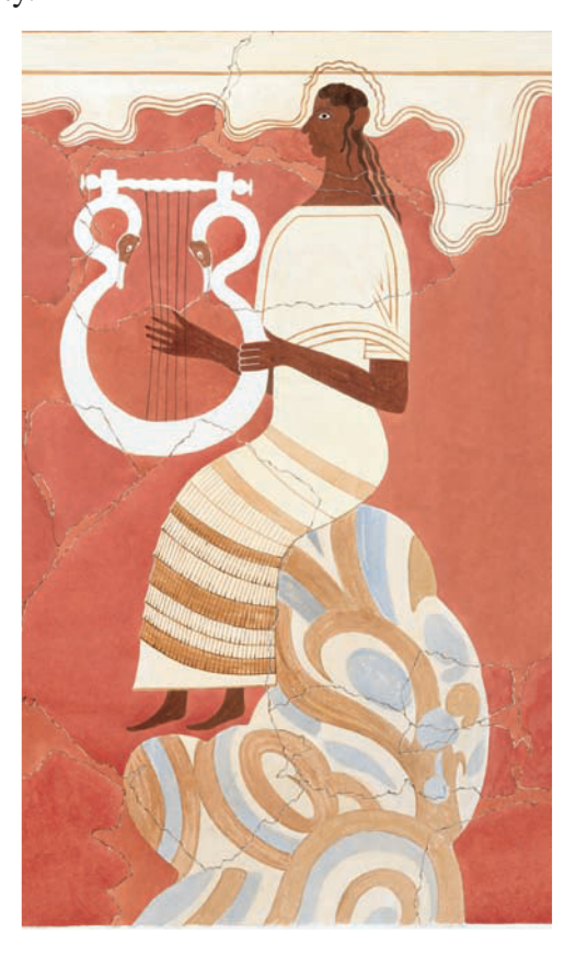
Source 8: The lyre player (Orpheus fresco, palace of Pylos)