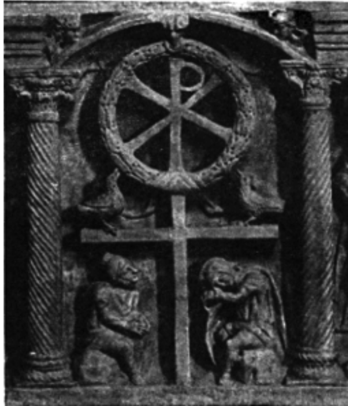
MARBLE SARCOPHAGUS FROM THE DOMITILLA CATACOMB, ROME

'Art in Roman Britain', JMC Toynbee, Phaidon, London 1962, fig257.