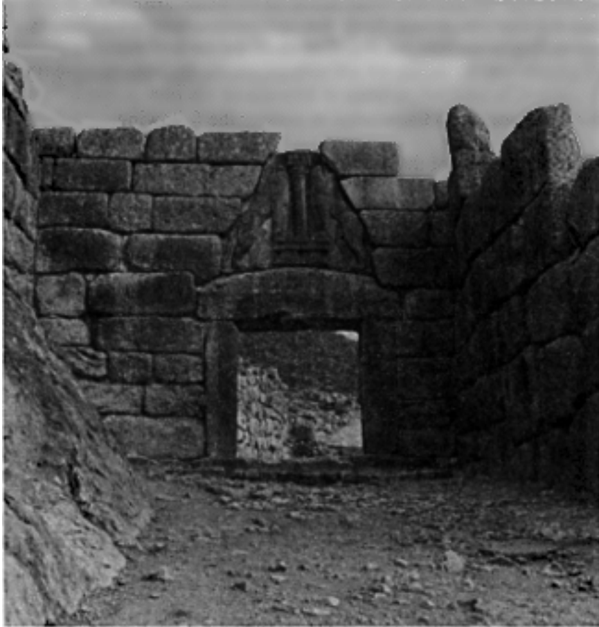
WALLS OF MYCENAE

'Mycenae-Epidauros', SE Jacovidis, Ekdotike, 1978, p31, fig12.