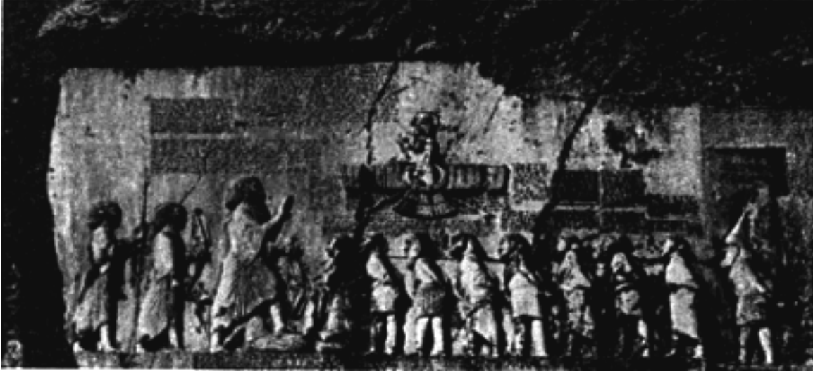
MONUMENT OF DARIUS FROM BEHISTUN