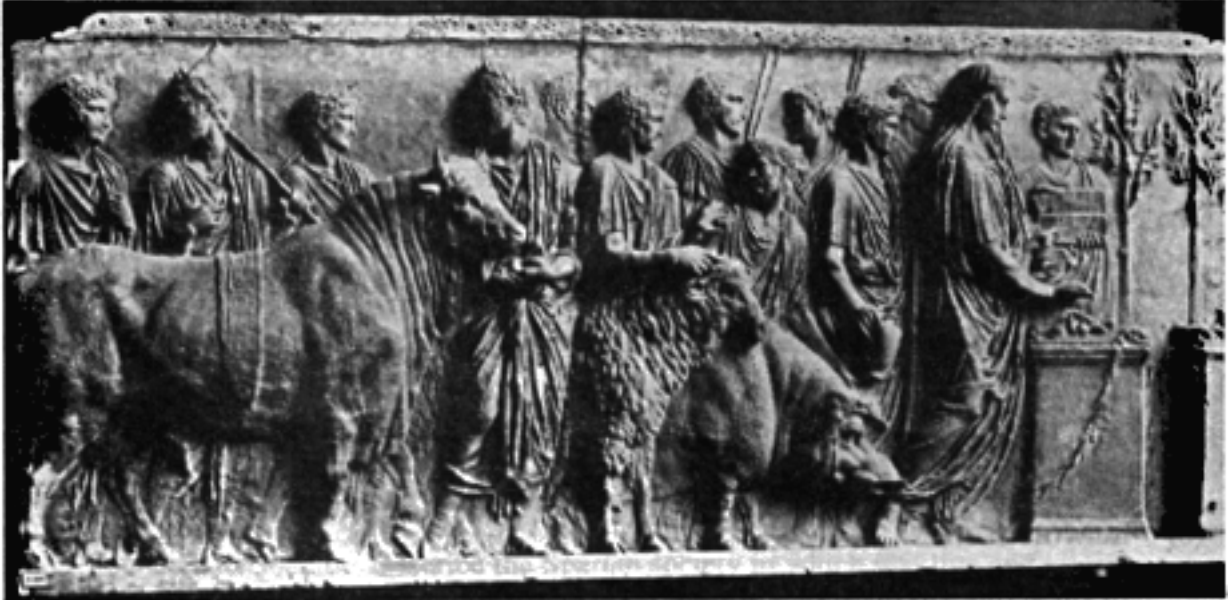
RELIEF FROM THE ALTAR OF AHENOBARBUS

Use Source K and your own knowledge to answer the following.