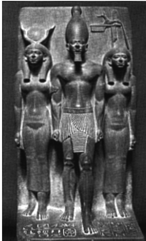
PHARAOH MYKERINUS/MENKAURE WITH TWO GODDESSES

Use Source A and your own knowledge to answer the following.