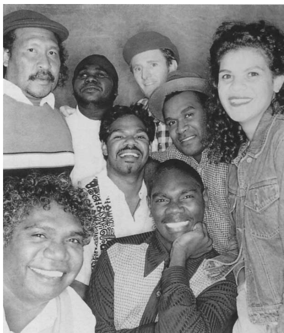
Yothu Yindi—Aboriginal rock band