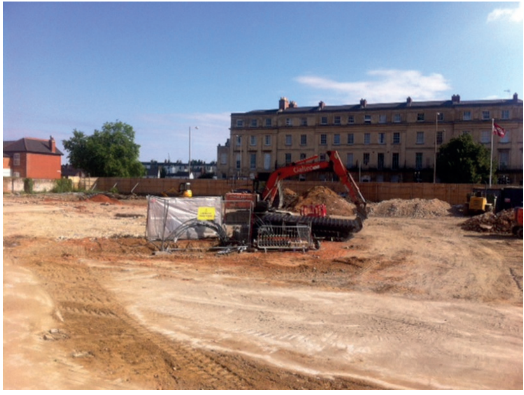
Figure 3: View looking north across the site