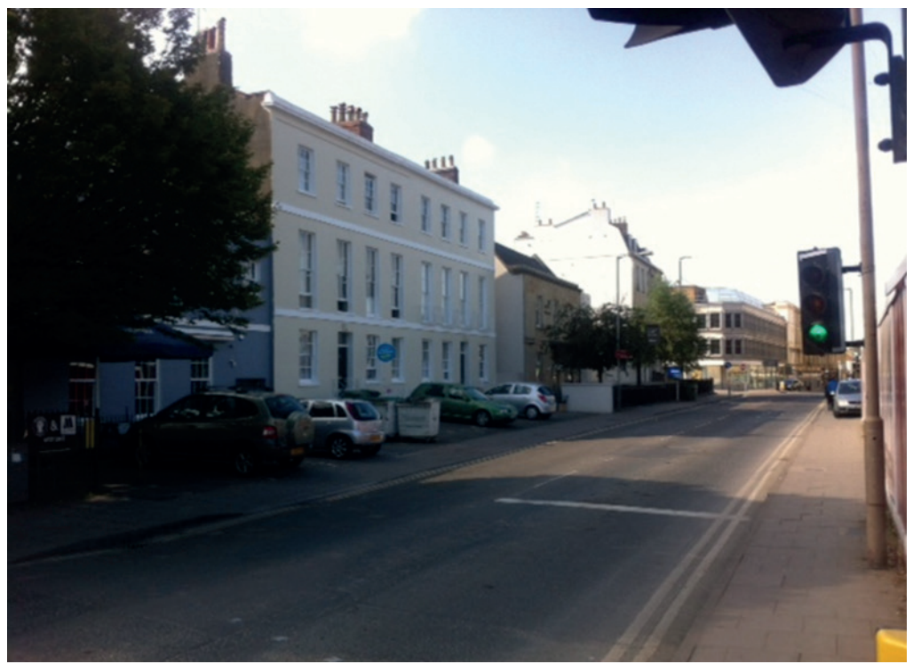
Figure 4: View looking south along High Street with the site on the right hand side