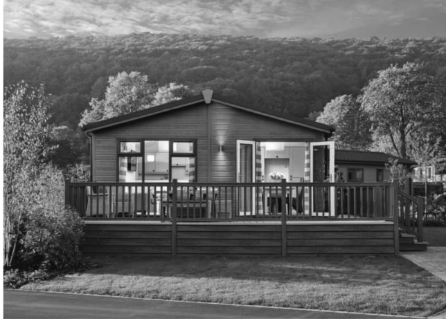
(Adapted from: www.insuremylodge.co.uk )

(c) Explain two reasons why the log cabins at SunnSky may be suitable for a family with a baby and a toddler.