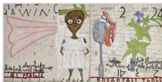
Rose Wylie 'Bagdad Café (film notes)' 2015