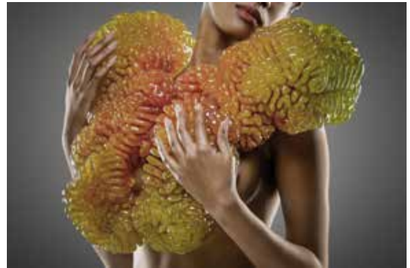
Neri Oxman 'Luna's Wanderer' 2014