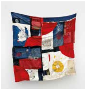
Junko Oki 'Time Machine' 2017