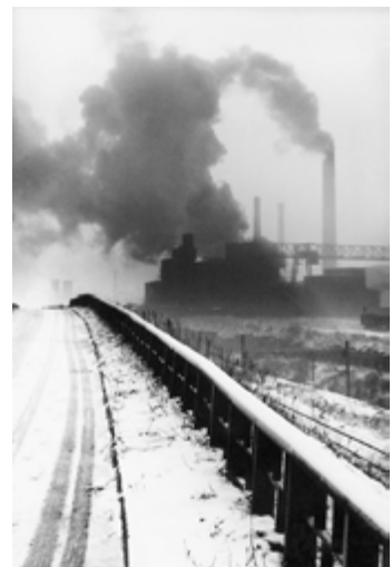
Michal Calá 'Chorzów Stary' 1980

'It is in our nature to explore, to reach out into the unknown. The only true failure would be not to explore at all.'