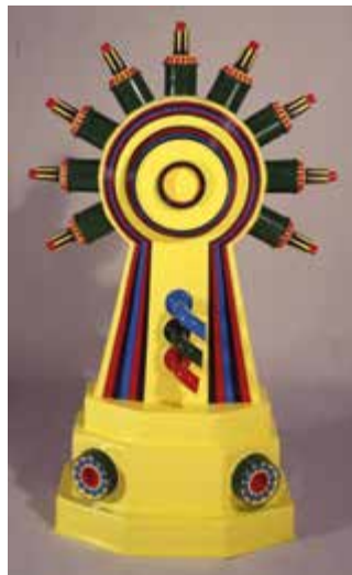
Eduardo Paolozzi 'Diana as an Engine' 1963/66