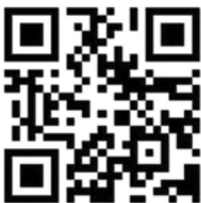
Richard Long www.richardlong.org