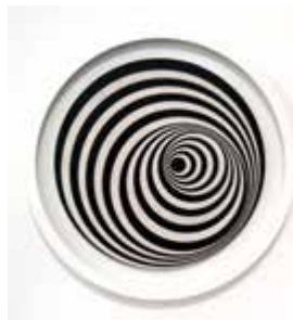
Bridget Riley 'Uneasy Centre' 1963