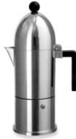
La Cupola (espresso coffee maker) Designer: Aldo Rossi

The fundamentals of the visual, tactile and aesthetic design factors are sometimes referred to as design elements and principles. Below is a list of some of the fundamentals and their applications which are used in design.