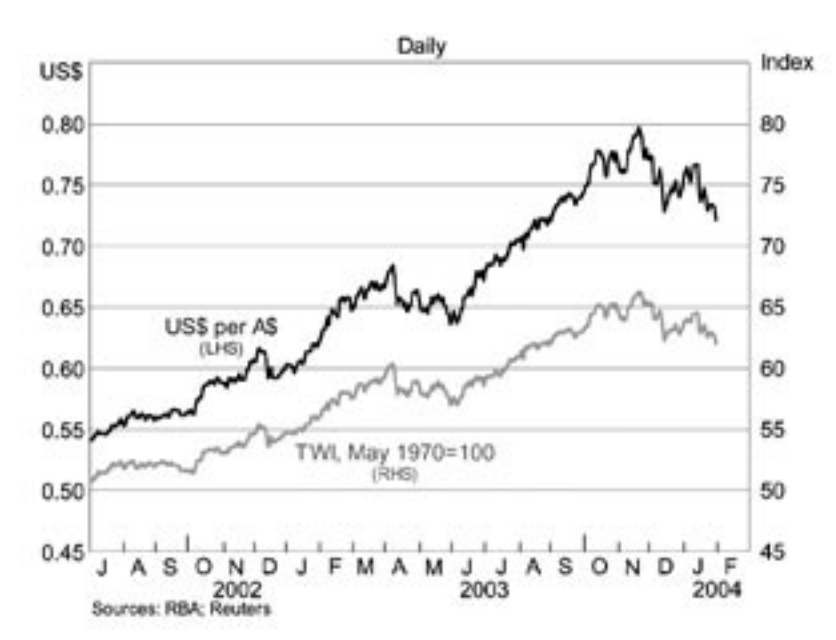
Figure 1. Australian Dollar and Trade Weighted Index (TWI)

http://www.rba.gov.au/ChartPack/exchange\_rates.pdf