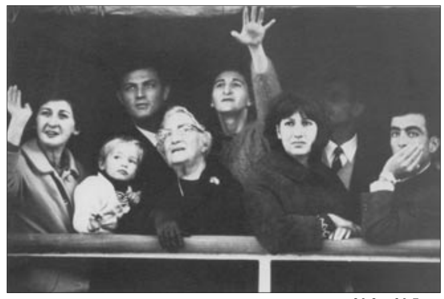
20.2 \times 30.7 \text{ cm}

Please remove from the centre of this book during reading time.