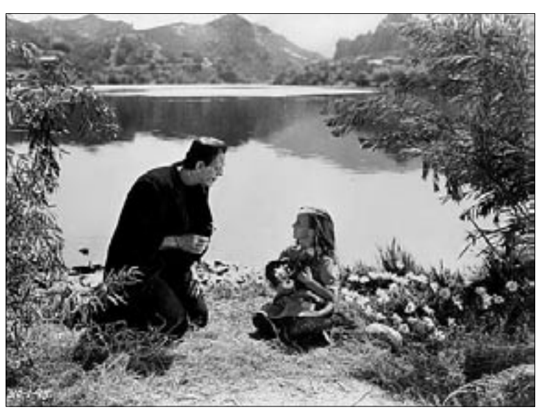
6. James Whale (director), still from Frankenstein (35 mm film), 1931

5. Krzysztof Wodiczko, Untitled , installation work incorporating photographic images projected onto the walls of the Hirshhorn Museum and Sculpture Garden, Washington DC, 1990