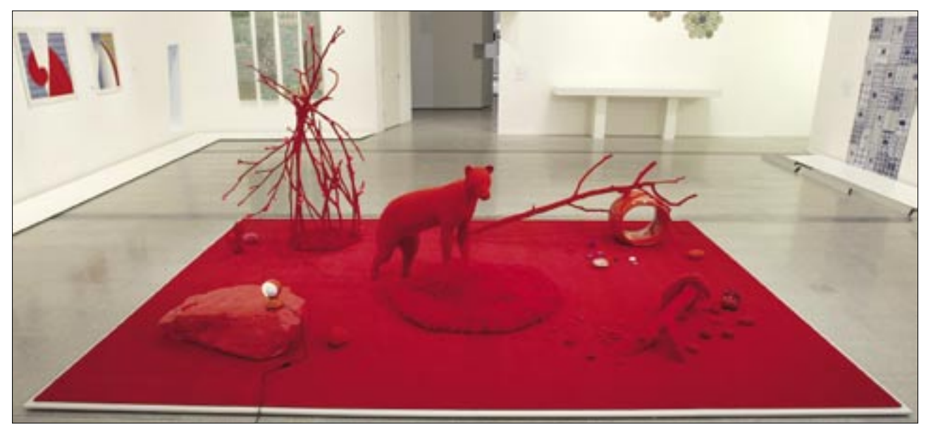
500 \times 300 \times 220 cm

1. David Moore, European Migrants Arriving in Sydney (silver gelatin print), 1966