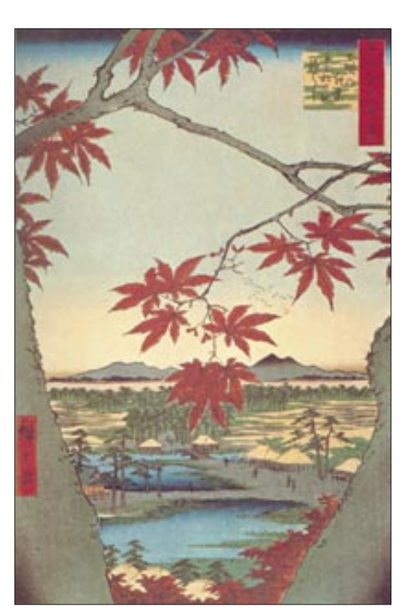
35 \times 24 cm

C. Rogier van der Weyden, St Luke Painting the Virgin (oil and tempera on panel), ca. 1435–40