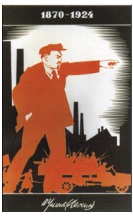
108 \times 68 cm

9. Unknown central American artist, Jaguar Jar (earthenware body, white slip and oxides), ca. 1200–1550