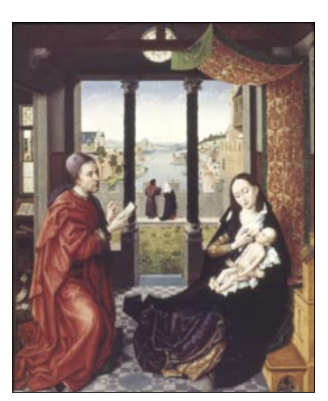
138 \times 111 \text{ cm}

B. Watjinbuy Marawili, Bäru , Creator of Fire (earth pigments on bark), 1968