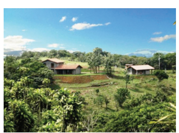
Coffee farm in Costa Rica