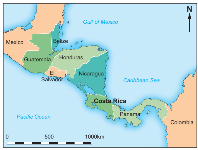
Map of Central America

Costa Rica is a small, politically stable, Spanish-speaking country in Central America with a high quality of life and a good record of human rights and democracy. It has one of the best health care systems in the world and the government is committed to good, affordable health care for all. This includes reducing exclusion and inequalities faced by migrant and indigenous people. Costa Rica is famous for its high quality coffee exports which make up 3.4% by value of export earnings. The Ngöbe-Buglé people are an indigenous tribe who live in the border region of Panama and Costa Rica. Many of the tribe migrate into Costa Rica for the coffee harvest for six months every year.