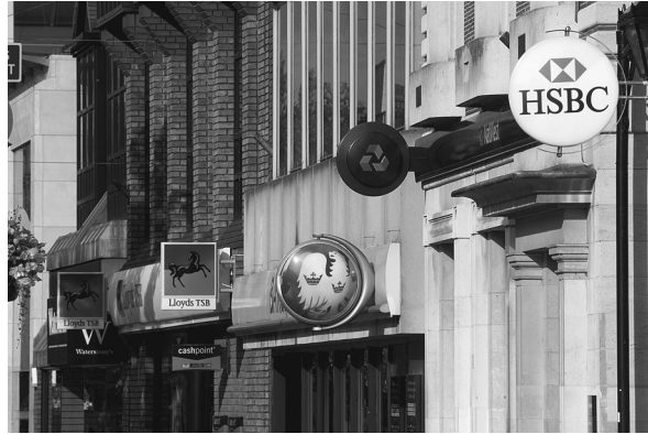
Figure 1 High street banks

At the end of the first year there would