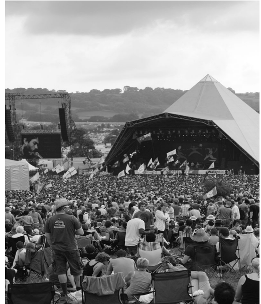
Figure 1 A crowd listening to loud live music