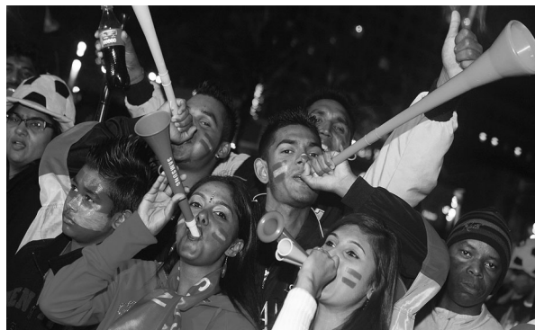
Figure 4 Vuvuzelas being blown after a 2010 world cup football match

This means that if we consider a sound level of 85 decibels, this will sound x = 2^{\frac{85}{10}} = 362 times louder than something we can barely hear.